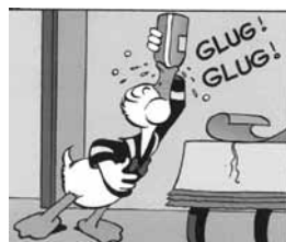
Figure 3. Donald drinking

5 W and there (( Figure 5 )) kind of #spsch# [#splash# ]