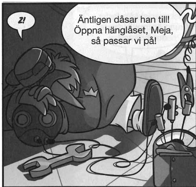
Figure 8. Snoring. Ferrari, Pochet, and Zanotta (2012, p. 26)

The two participants are in effect searching for two different things, Wilma is searching for a bubble (which is the topic of the lesson) and Andreas is instead searching for the snoring sound effect – possibly as this follows on their earlier talk of sound effects such as glug and splat . Andreas’ suggestion indicates that a visual representation of snoring is suggestive of a character sleeping – and where there is sleeping there might also be dreaming. Thus, he makes a connection between these two visual representations, the displayed character action of sleeping on the one hand, and the produced text and visual representation of the sound they produce whilst sleeping on the other. It could be argued that a sleeping character do not necessarily need to be snoring, but in comics these two are often combined, possibly to differ between characters merely lying down, or a dead character.