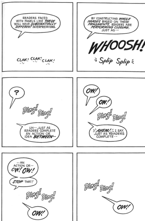
Figure 1. Sound effects without paired imagery. McCloud (1993, p. 87, cropped for space) © Scott McCloud.

The problem with discussing sound effects is of course that as ink on the page, these visual representations do not, in fact, make any sound at all. As Scott McCloud illustrates in Understanding comics , characters are often (mis)represented as “saying” something, even though in reality “no one said a word” (1993, p. 25), and the reader is assumed to imagine this sound for themselves. Similarly, Joost Pollmann (2001) argues that “comics can be quite noisy” (p. 9), referring to the many visual representations of sounds, speech and music that exist in them – even though they do not produce any sound. As Ian Hague explains, “the reader is tasked [...] with the conversion of sounds from visual representations to audible manifestations” (2014, p. 80).