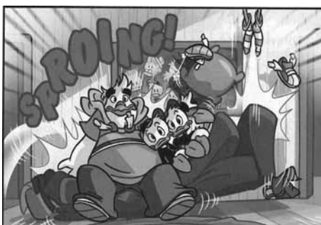
Figure 10. Sproing

In this excerpt, Charles initiates the reading of a visual representation of a sound (SPROING!, Figure 10) – made as a rotund character (called Putte) sits down on the far side of a sofa, producing a see-saw effect where the smaller character (called Alfred) on the other side of the sofa flies up in the air (Alfred's socks are visible on the upper-right side of the panel). This is the first sound text that is read aloud in this sitting, and this text has clearly drawn Charles' attention (it is also the only text in this panel). Unlike Andreas in previous excerpts, Charles reads the sound text atonally and carefully, basically reading the word verbatim – this reading does not differ significantly from his reading of other words. In line 4, Jonna then loudly rephrases the sound that Charles produces (in overlap with his repetition of it). She uses more emphasis, and constructs sensation into the sound, and then asks him to explain what happens in the image. It could be argued that Charles, as a novice reader, focuses on reading the word (sproing) rather than the effect (SPROING!) – this could also be evinced by his re-reading of the same word twice. Emphasising textual