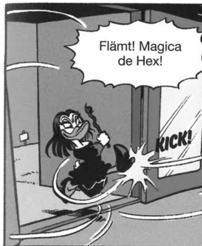
Figure 6. Magica kicking