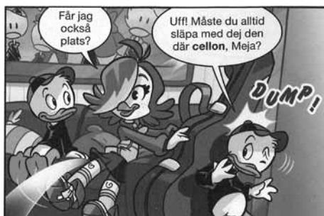
Figure 12. Dump