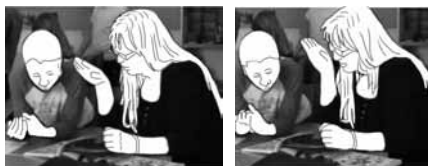
Figure 4. Wilma's splat