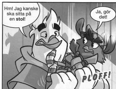
Figure 11. Ploff © Disney, used with permission.