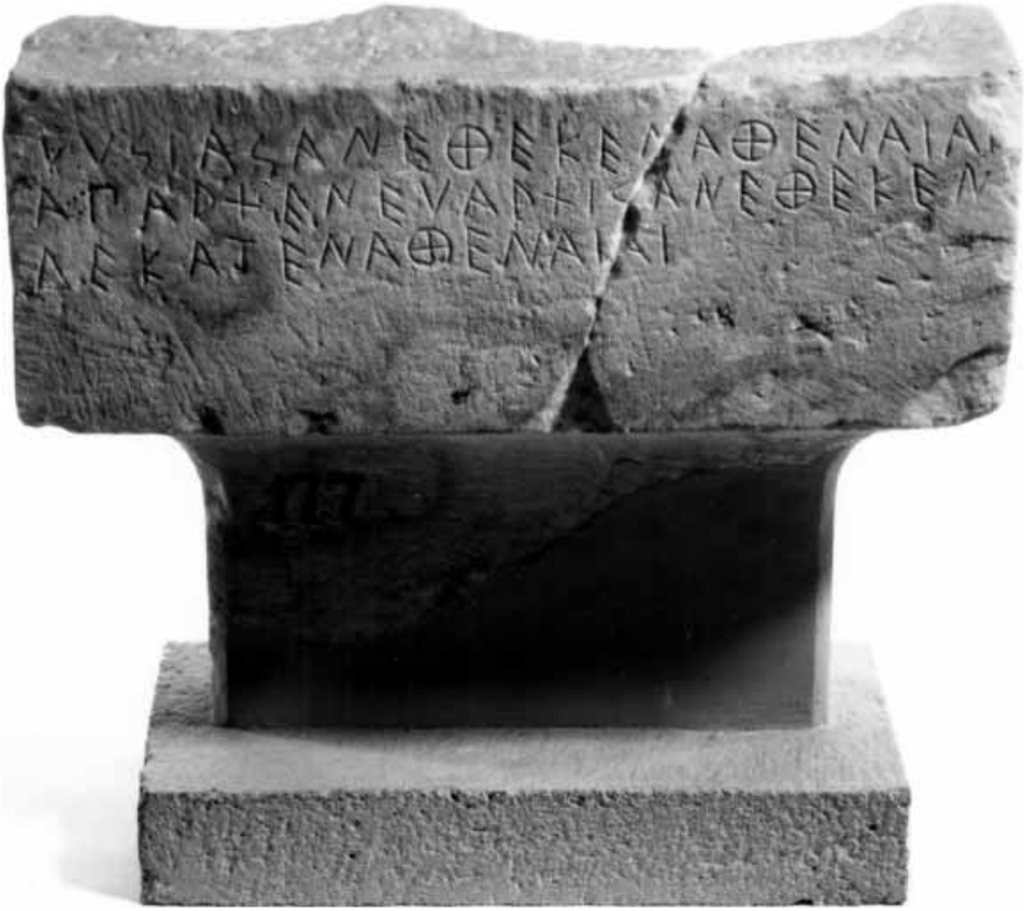
3. Inscribed base ( DAA no. 292) for two korai dedicated by Lysias and Eurachis; the “Red Shoes” kore (Acr. no. 683) stood in the round plinth cutting on the viewer’s right.

from the same sorts of profits, making attempts to pin down distinctive meanings for the two terms in the private sphere difficult. Nor do the individuals who gave dekatai as opposed to aparchai or dedications of unspecified type seem to reflect a link between the use of the two formulas and identifiable sociopolitical or gender divisions in Athens. As we see in a subsequent chapter, the same types of statues (e.g., the marble kore) could be given as an aparche , a dekate , or neither one, and neither formula seems to have been restricted in its use to the period before the Persian sack of the Acropolis in 480 B.C.