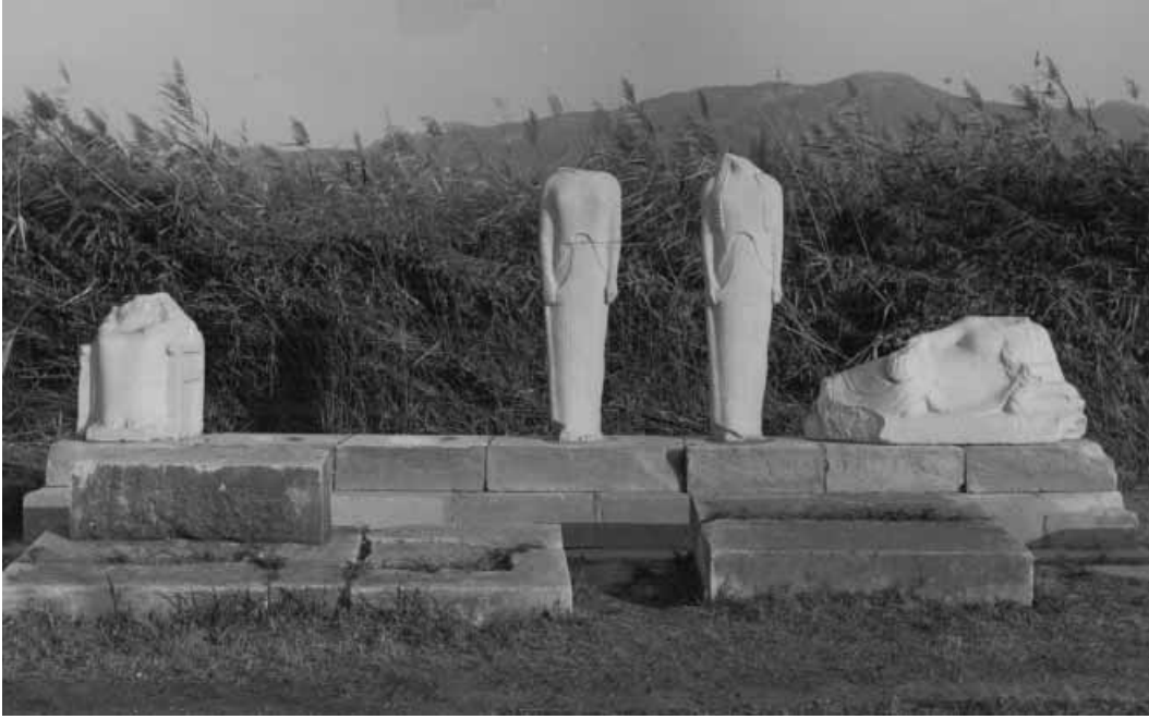
9. Geneleos group; plaster casts on base in situ in the Samian Heraion. Copyright Deutsches Archäologisches Institut-Athen, neg. nr. 87/597.

on vases and statues of animals as well as on statues representing gods and human beings demonstrates that any anathema could be perceived by the Greeks as speaking in the first person. 61 On the Acropolis statue bases, Ich-Rede always takes the form of the accusative pronoun, με , as in the following example ( DAA no. 3): “Iphidike dedicated me to Athena Protector of the city.” Grammatically the first-person pronoun in these inscriptions can be used instead of a third-person demonstrative pronoun, and on the Acropolis dedications the demonstrative pronoun was employed just as often. Dedicatory inscriptions incorporating Ich-Rede gave the monument as a whole a voice designed not to identify whom the statue represented, but instead to prevent viewers from forgetting the name of the dedicator.