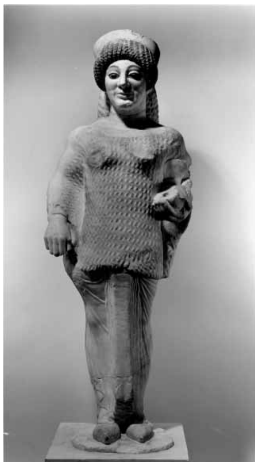
4. “Red Shoes” kore (Acr. no. 683).

Nevertheless, one Archaic statue dedication on the Acropolis demonstrates that aparche and dekate were recognized as mechanisms for making dedications different enough from one another to be worth distinguishing. 20 This is DAA no. 292, an inscribed rectangular pillar dedicated jointly by Lysias and Euarchis (Fig. 3). The inscription consists of two independent dedicatory texts written one after the other by the same hand in three inscribed lines: “Lysias dedicated to Athena an aparche ; Euarchis dedicated a dekate to Athena.” The top of the base shows cuttings for two separate marble statues: an extant under-life-size marble kore (Acr. no. 683; Fig. 4) stood in the larger, round cutting on the right-hand side; the cutting on the left is also round, and its diameter is just over half that of the cutting for kore Acr. no. 683. If the cutting on the left held another marble kore much smaller than Acr. no. 683,