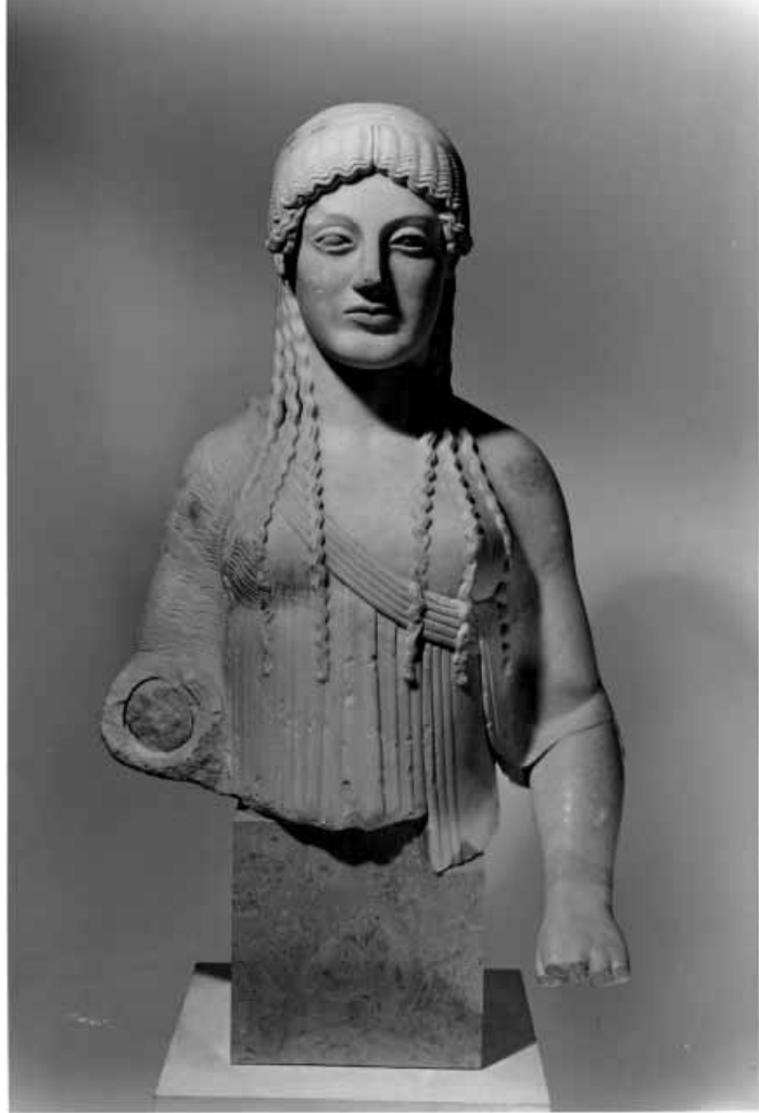
1. Euthydikos' kore (Acr. no. 686); front.