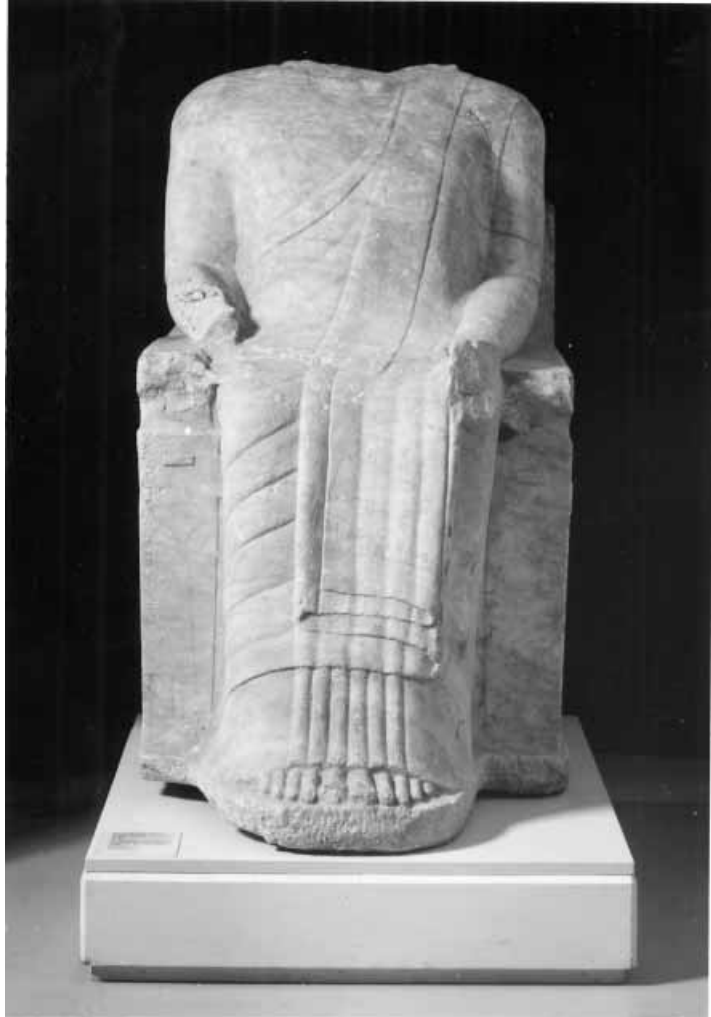
7. Statue of Chares from Didyma; British Museum inv. B 278.

Inshushinak, that his name shall become extinct, that his offspring be barren, that the forces of Beltiya, the great goddess, shall sweep down on him. This is Napir-Asu's offering. 55