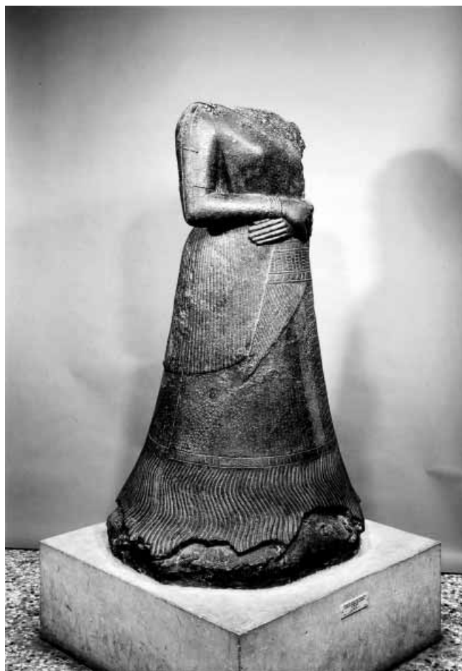
6. Bronze statue of the Queen Napir-Asu with Elamite inscription from Susa; Louvre inv. Sb 2731.

Examples of the practice of disjunctive representation can be found in Near Eastern cultures, where inscriptions proclaiming in the first person a king's deeds and titles might be inscribed upon a variety of freestanding and relief figures without regard to what or whom they represented. 54 Nevertheless, "conjunctive" as opposed to disjunctive statue inscriptions were equally common. An important type of statue found in both Egypt and the Near East is the "speaking statue," which is a statue representing a ruler or noble and inscribed with a text of the subject's own utterances. One example of a Near Eastern speaking statue is the life-size bronze image of the fourteenth-century B.C. Elamite queen, Napir-Asu, which is now in the Louvre (Fig. 6). Its inscription reads as follows: