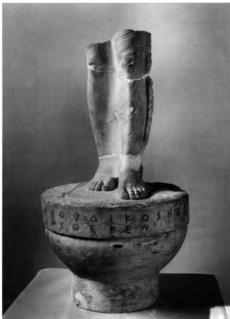
2. Inscribed base (DAA no. 56) with lower legs of Euthydikos' kore (Acr. no. 609).

an original term denoting a “solemn assertion.” 7 The euche as a vow served as the fundamental mechanism for dedicating an anathema in a Greek sanctuary. The worshipper typically promised beforehand to make an offering on the condition that some benefit ( charis ) requested of the gods was received; once the terms had been set by the worshipper, the vow had to be fulfilled if the gods delivered. 8