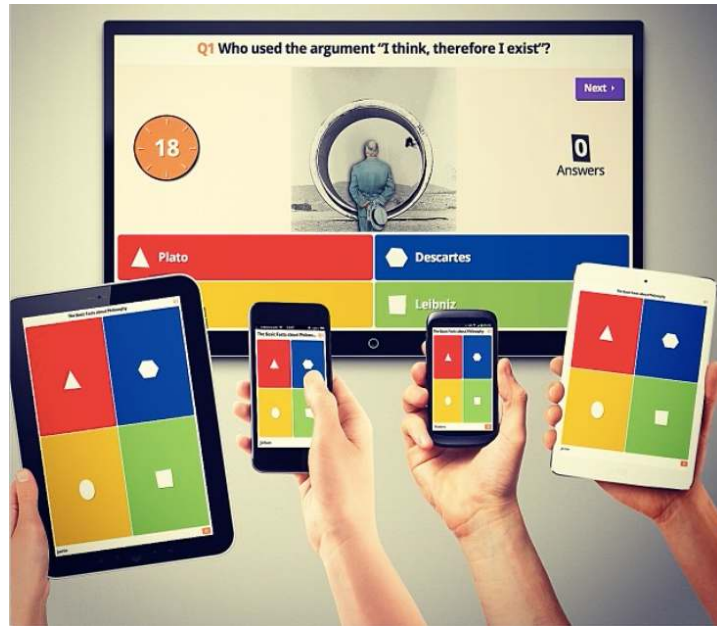
Fig. 2 Giving answers in Kahoot!

When the time to give answers is up, a distribution of the students' answers are shown on the large screen. At the same time, the students get individual feedback on how they have answered on their devices. The distribution of the students' answers gives the teacher feedback on the students understanding of the question, and open for a good opportunity to elaborate on the question and the answers. A scoreboard of the top 5 students with points and nicknames is shown between questions. Every student can also follow her or his own score and ranking on own device. To get a high score, the students have to answer correctly as well as fast. Music and sound effects are used in Kahoot! to create suspension and the atmosphere of a game show.