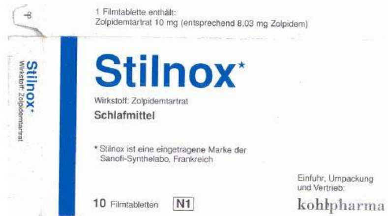
Figure 1: Figure of the imported drug package of Stilnox produced by Sanofi-Synthelabo and marketed by kohlpharma .