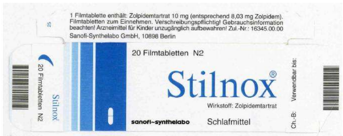
Figure 2: Figure of the original drug package of Stilnox produced by Sanofi-Synthelabo .