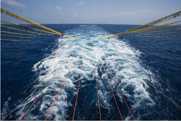
Fig. 1. Ship towed methodology for geotechnical surveying.

mission planning issues to be faced in the project. Section VI addresses the communication activities within the project and Section VII briefly accounts for the necessary system integration and experimentation activities. Finally Section VIII reports concluding remarks.