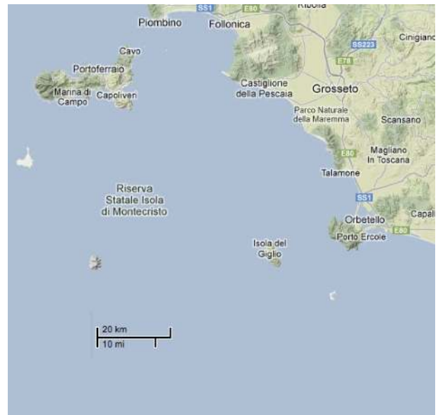
Fig. 4. Elba island (Italy) area: one of the candidate sites for the final WiMUST tests.

Specific activities for system integration are planned within the project: indeed all the subsystems and functionalities developed within the project will need to be integrated to form the final WiMUST system. Moreover, the overall system will be validated through experimental tests at sea. The vehicles constituting the WiMUST system will need to perform cooperative guidance, navigation - localization and control by