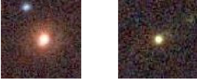
Fig. 3. Color-composite cutouts (2.2 arcsec across, 0.03 arcsec/pixel) from the b , v , i , z HST/ACS observations of GOODS-South (Giavalisco et al. 2004). Left XID 153. Right XID 202.