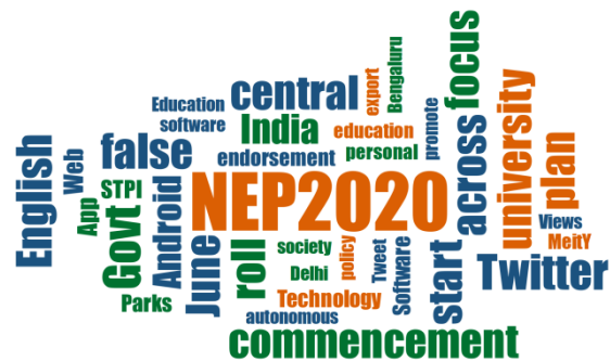
Figure 2: Wordcloud Based on the Policy Document of NEP 2020

In a word cloud, different keywords are represented based on their frequency in the dataset (Sinclair & Cardew-Hall, 2008). Figure 2 indicates the most frequent words on NEP. These frequencies have been derived from the data extracted from the Twitter. Higher size of word indicates the highest frequency. No surprise in NEP2020 as highest size. Figure 2 represents the word cloud of standard words in relation to higher education. The term NEP 2020 dominates because of its repeated usage. It is surrounded by preferential words associated with policy (university, plan, commencement, India), technology and software (education software, app, web, STPI, Parks, Twitter, Android.) and Centricity (personal, autonomous, society).