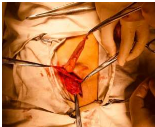
Figure 2. Vermiform appendix in the hernial sac

neither inflamed nor showed other signs of pathology. The intervention continued with herniorrhaphy (using the retro funicular procedure), followed by hernioplasty using the Lichtenstein tension-free mesh repair. The repair mesh was a composite polypropylene mesh.