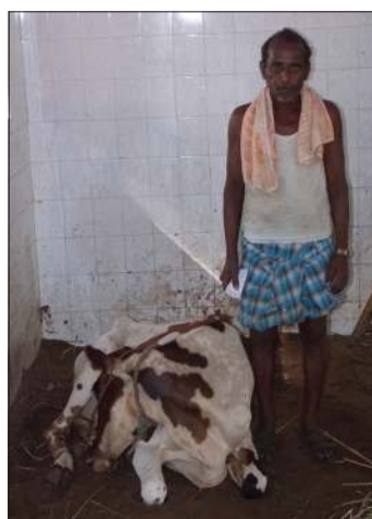
Figure-1: Sternal recumbency in a cow with botulism before treatment; posture resembled second-stage hypocalcemia.

Many researchers attempted symptomatic management of cattle with botulism [21]. Jean et al. used injectable Vitamin E and selenium and isotonic fluid therapy without much success [17]. In this study, Group III cattle with botulism were treated with activated charcoal and Vitamin AD 3 E injections (10 ml IM) daily. No antibiotic was used in Group III as antibiotics like aminoglycosides, tetracyclines, and procaine penicillin tend to worsen the flaccid paralysis caused by BoNT [14]. As a palliative measure, oral administration of activated charcoal, sodium sulfate, and subcutaneous administration of neostigmine were the treatment adopted by Senturk and Cihan [22]. Early cases in standing posture with restlessness and sternal recumbency with alert mentation were treated successfully. One pregnant cow recovered after