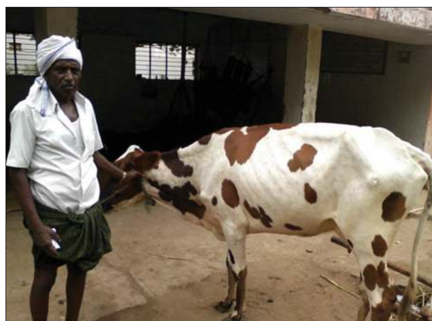
Figure-2: Cow recovered after 13 days of treatment and nursing.

30 days and calved successfully. Kummel et al. (2012) reported maintenance of pregnancy and recovery from botulism in a cow [20]. Despite contradicting the recommendations of intravenous fluid administration