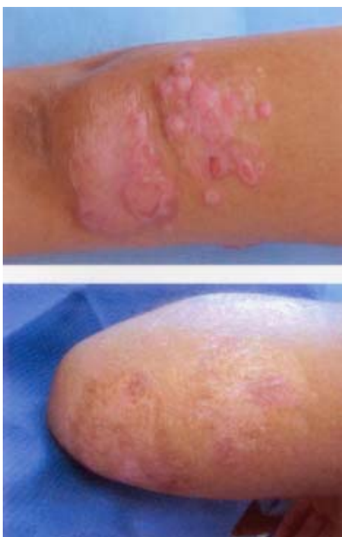
Fig. 2: extensive cutaneous plaques of early diffuse cutaneous leishmaniasis, case 6, before (above) and 7 months after (below) immunotherapy.

and 6 years old, cases 5 and 7; the predominant IgG subclass in the 10-year-old, case 6, was IgG4. Immunotherapy was not accompanied by significant changes in the isotype distribution of specific antibodies during an average one-year observation period (data not shown).