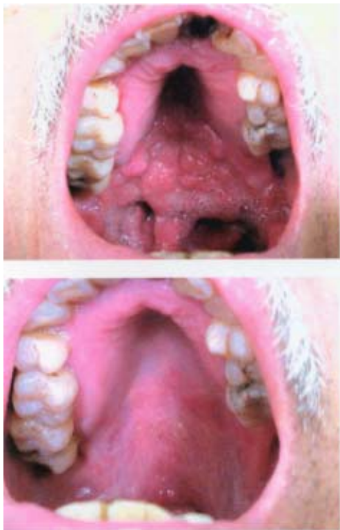
Fig. 1: patient, case 1, with mucocutaneous leishmaniasis showing lesions of the palate, uvula, and pharynx before (above) and 6 months after (below) immunotherapy was begun.