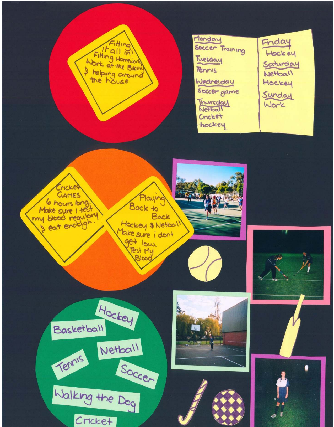
Figure 2 Sophie's poster.