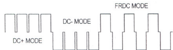
Fig. 1. FRDC waveforms.

Fig. 2 is a block diagram of the measurement system that uses the Josephson array. To synthesize the FRDC waveform, the computer loads the waveform memory with the required state (-1, 0, +1) of the array for up to 65 536 time steps of the specified waveform. When the waveform clock is started, the memory steps through the time sequence, and its outputs drive