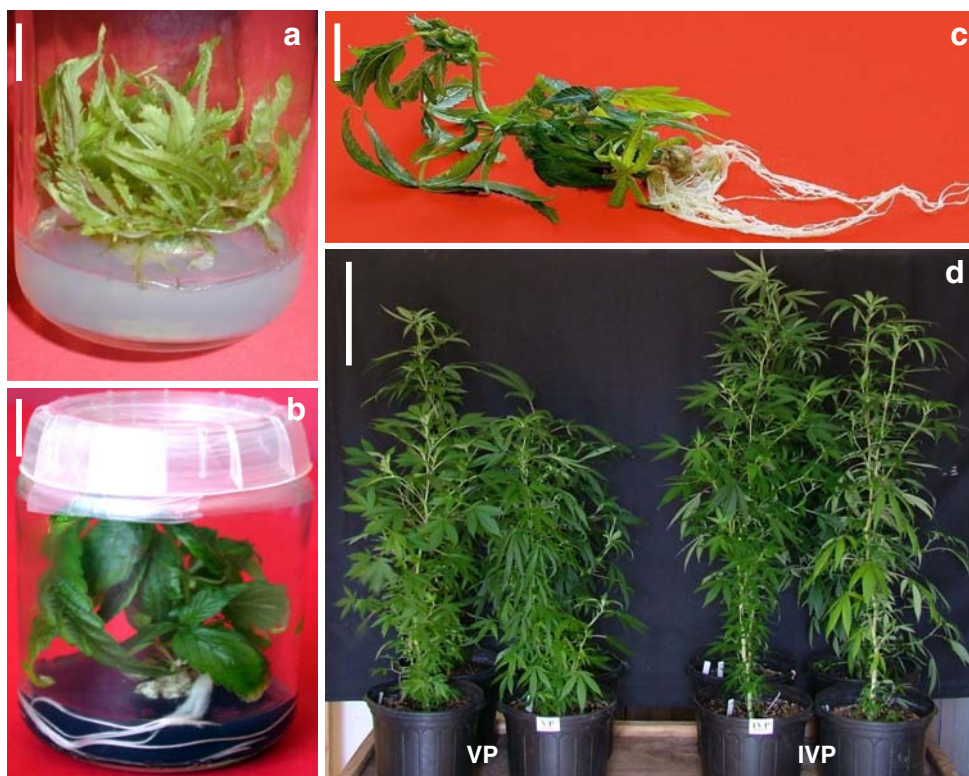
Figure 1. (a) Shoot multiplication of C. sativa on MS. (b) Rooting on 1/2MS medium supplemented with 500 mg l -1 activated charcoal and 2.5 \mu\text{M} IBA. (c) Well rooted plantlet prior to soil. (d) Ex vitro vegetatively propagated (VP) and in vitro vegetatively propagated (IVP) plants. Bars represent 1.22 cm (a), 1.31 cm (b), 2.3 cm (c) and 32 cm (d).

Shoot proliferation and multiplication. Of the three cytokinins used, TDZ was most effective for shoot proliferation (Table 1). TDZ, a synthetic phenylurea, is considered to be one of the most active cytokinins for shoot induction in plant tissue culture (Huetteman and Preece 1993). Reports suggest that TDZ induces shoot regeneration better than other cytokinins (Thomas 2003; Thomas and Puthur 2004; Husain et al. 2007). The nodal segments proliferated shoots within 14 d of culture on MS medium containing 0.05–9.0 \mu\text{M} TDZ without intervening calluses. The optimal response in terms of percentage of explants producing shoots with maximum shoot length and the highest number of shoot per explant was recorded on MS medium supplemented with TDZ (0.5 \mu\text{M} ; Fig. 1a). On this medium, 100% of the cultures responded with an average of 13 shoots per culture (Table 1). The regenerated shoots elongated within 2 wk of culture. However, TDZ at higher concentrations than 5.0 \mu\text{M} resulted in suppressed shoot formation. Magioli et al. (1998) have reported the superiority of lower concentration of TDZ in Solanum melongena using a similar explant. Such a response may perhaps be