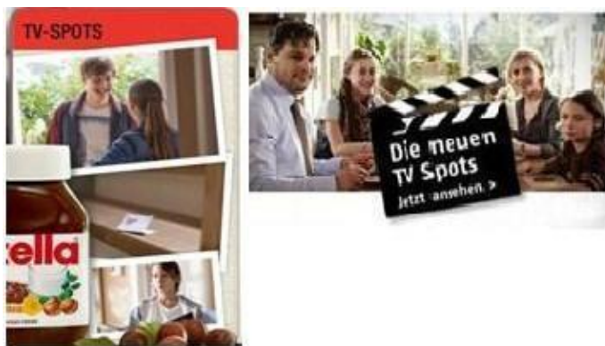
Screenshot 2: Presence of people on the German website

The Canadian website has two images that show people. On one of the pictures a toddler eating a bread with Nutella, on the second picture four children are shown smiling. On the second picture the product is not displayed.