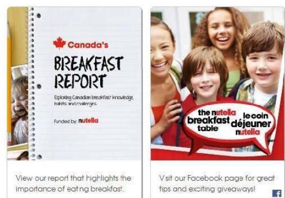
Screenshot 3: Presence of people on the Canadian website