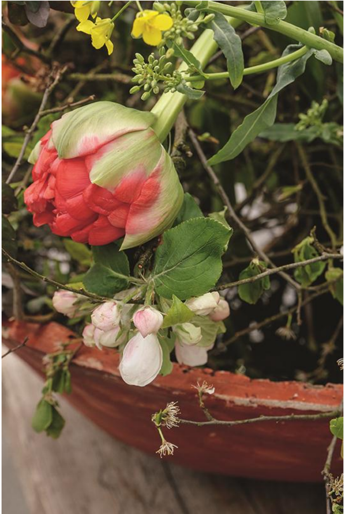
Figure 5: Flower arrangement