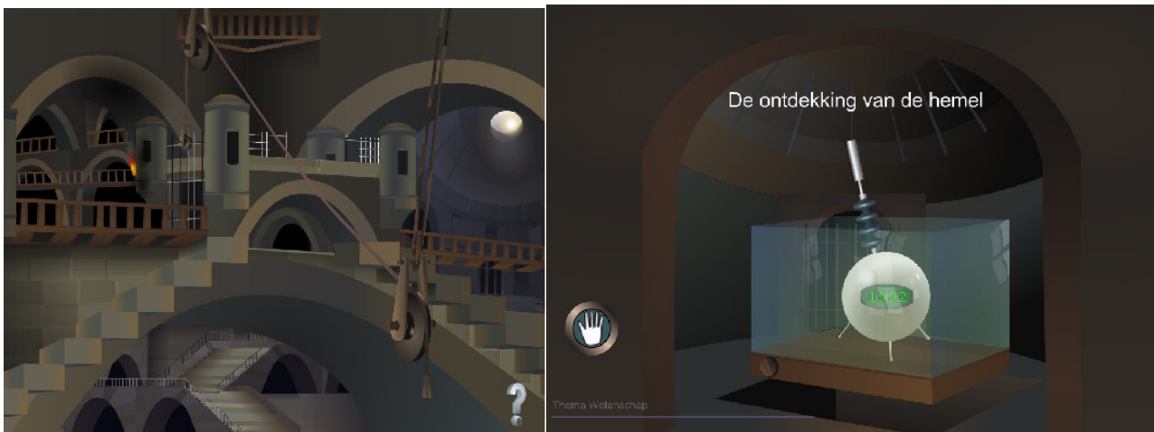
Figure 3 Two screens from the Mulisch-website: the homepage (left) and a subpage ('time machine').