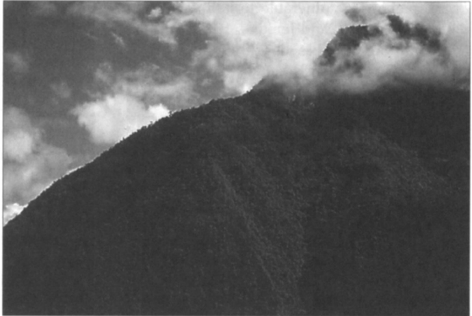
Cloud forest in the Cordillera de Colán from 1900 m at site 1.

yellow-tailed woolly monkey will be presented elsewhere (Butchart et al. , in press).