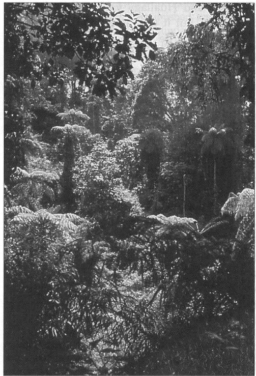
Cloud forest at 2300 m at site 1 in the Cordillera de Colán (Nathalie Seddon).

A further 14 mammal species were reported by local people, but were not observed by the authors: giant anteater Myrmecophaga tridactyla , southern tamandua Tamandua tetradactyla , brown-throated three-toed sloth Bradypus variegatus , white-fronted capuchin Cebus albifrons (also kept as a pet in San Cristobal village), red howler monkey Alouatta seniculus , white-bellied spider monkey Ateles belzebuth ,