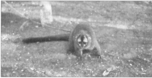
A captive Andean night monkey Aotus miconax , San Cristobal, Cordillera de Colán (Stuart Butchart).

site 1, including scats, a tree-trunk heavily scratched up to a height of 2 m, and a well-worn path, which local hunters said had been made by a bear, running along a fairly flat narrow ridge-top. Peyton (1981) also noted bear trails running along ridge-tops. A study of this species in Peru in the late 1970s (Peyton, 1980) concluded that the best habitat for bears was humid forest between 1900 and 2350 m. Similarly, in Venezuela Goldstein (1990) found that the key habitat for spectacled bears occurred at humid sites between 2000 and 2500 m. Such habitat is being rapidly degraded, and a protected area containing suitable habitat in the Cordillera de Colán would support the conservation of this species in Peru.