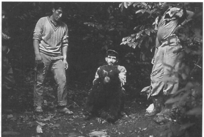
Spectacled bear shot by a local hunter in the Cordillera de Colán (Roger Barnes).

it highly susceptible to hunting (Foden, 1963; Wolfheim, 1983; Peres, 1991), and it has been driven to local extinction in most areas where it is hunted (Peres, 1991). The yellow-tailed woolly monkey is likely to be similarly susceptible to hunting. Mittermeier et al. (1977) noted that the species was attractive to hunters, being large, conspicuous and confiding, and Leo Luna (1980) concluded from the composition of groups she observed that the species has a low birth rate. Thornback and Jenkins (1982) noted that this species was often the first primate to disappear following human encroachment into suitable habitat. At least two individuals at site 1 had been shot for food in May–June 1994. In addition, the species seems unable to adapt to secondary