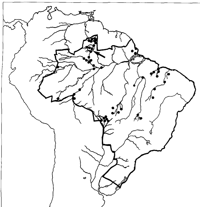
Figure 1. Map of Brazil indicating regions of investigation. The arrow indicates region of mercury test sites, state of Roraima: at the middle reaches of the Rio Branco, Praia do Brazil; Rio Ajarah, at Ilha da Viura, approximately 20 km upstream from the Rio Branco; and at the mouth of the Rio Mucajai where it joins the Rio Branco.