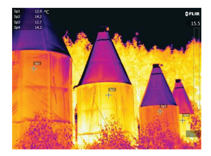
Figure 1. Infrared camera (FLIR) photograph showing control (orange) and elevated temperatures (yellow) in new experiments with the whole tree chambers at the Hawkesbury Institute for the Environment at the University of Western Sydney.

The original study and those that capitalized on the original design contributed enormously to knowledge on the consequences of nutrient availability on ecosystem and tree-level physiology, and on the interactions of nutrition and forest responses to elevated [CO<sub>2</sub>] and temperature. This research has