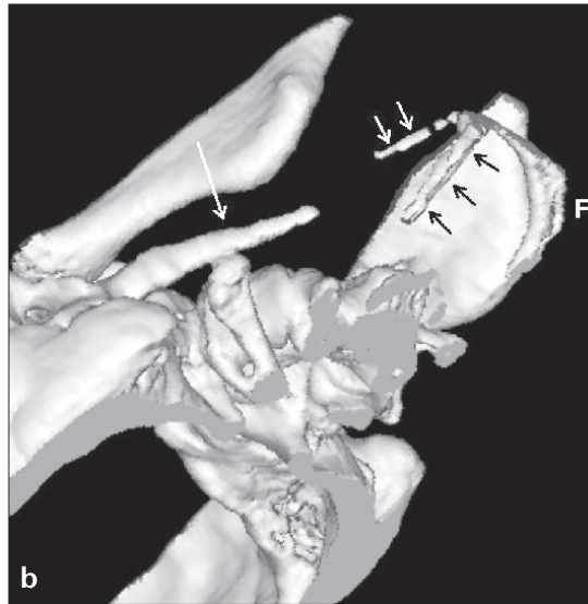
Figure 1. a, b. 3D-CT images of a 36-year-old male. a. Demonstration of bilateral styloid processes from the anterior aspect of the skull (the mandible was excluded). The right styloid process (45.6 mm) ( long arrow ) is significantly longer than the left (37 mm) ( short arrow ). b. Inferior-oblique view of the same case shows the right styloid process ( long white arrow ), the hyoid bone ( black arrows ), and the stylohyoid ligament calcification ( short white arrows ).