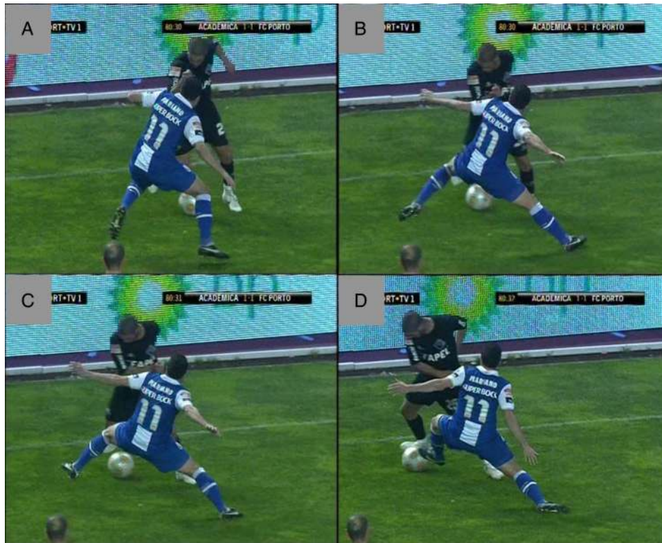
Figure 2 Non-contact pressing mechanism (right knee). (A) At -160 ms, the defending player is running forward at high speed towards the opponent in possession of the ball. (B) At initial contact, he strikes the pitch with his right heel and makes a sidestep cut in an effort to reach the ball or to tackle the opponent, but no player contact. (C) At 80 ms, he rotates the trunk towards his left leg and puts the entire load on his right leg. (D) At 240 ms the right hip and knee joints are in abducted positions and the ankle joint is in eversion (dynamic valgus without collapse).

All injuries occurring during landing after having headed the ball ( n=5 ) were the result of non-contact injury mechanisms (table 2). The injured players landed mainly on one leg only (table 3). In all one-legged landing situations, the injured player landed on his forefoot (figure 4 and online supplementary video 3). The individual flexion angles at IC was 10^\circ or less in all estimated cases for the knee, but showed greater variation for the hip (see online supplementary table S3). The median flexion angles were 10^\circ for the hip and 5^\circ for the knee at IC (table 4). Substantial hip abduction was seen in one case and knee valgus was seen in two cases (one unsure), and both of these were dynamic valgus collapses. Estimates of ankle eversion showed no clear trend: one 'yes', one 'no' and two 'unsure'.