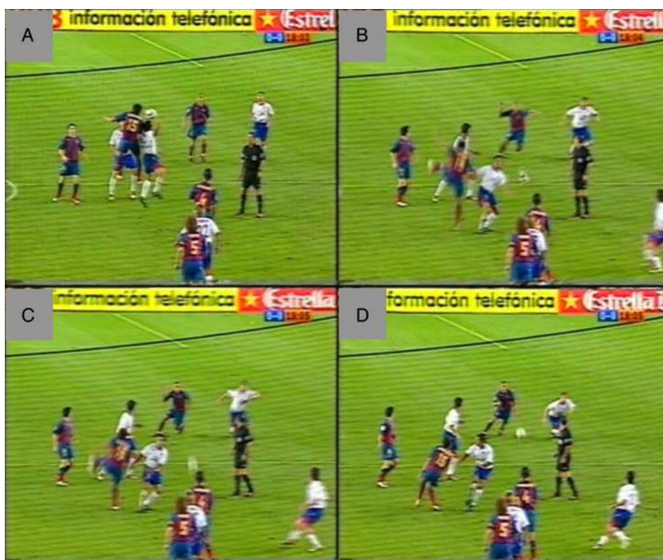
Figure 4 Non-contact heading mechanism (right knee). (A) At -306 ms, the player wins a heading duel while having trunk-to-trunk contact in the air with his opponent. (B) At initial contact, he lands at high vertical speed on his right leg striking the pitch with the forefoot. (C) At 80 ms, being out of balance both backwards and sideways, he puts the entire load on his right leg. (D) At 186 ms, his right knee joint clearly give way in substantial abduction (dynamic valgus collapse).

Although the classification of knee valgus was uncertain as determined by visual inspection in 11 cases in our study, we observed valgus in 15 of the 19 remaining cases. This finding is in line with previous research from several other sports, 10–13 29