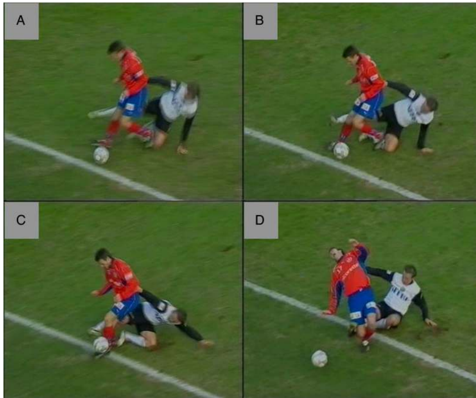
Figure 5 Direct contact mechanism (right knee). (A) At -60 ms, the player is jogging forward at slow speed towards the sideline trying to screen the ball from the opponent. (B) At initial contact, he strikes the pitch with his right heel and holds the trunk in a neutral position. (C) At 140 ms, having the entire load on his right leg, he is tackled from behind with forceful lateral impact to the knee joint. (D) At 440 ms, he falls backwards and his right knee clearly give way in substantial abduction (dynamic valgus collapse).

and suggests that knee valgus is also an important injury component in football. A sudden knee valgus increase was also reported in a non-contact ACL injury in a male professional football player, where the MBIM technique was employed. 31