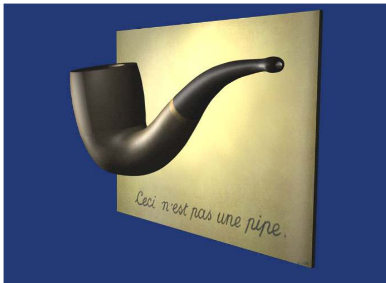
Figure 1: Homage to Magritte: “The Treason of Image Synthesis”. This is not a pipe either. 6

Keywords: computer graphics, realism, human vision, visual perception