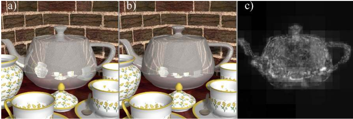
Figure 4: Images rendered with a) ray-traced and b) environment-mapped reflections. c) VDP output predicting visible differences between the images. Adapted from [17].

than differences. In both the teapots and other objects appear to be made of the same materials; the shapes, sizes and locations of the objects appear similar; and both scenes seem to be illuminated in the same way. Arguably, for most intents and purposes, the images are functionally equivalent . We have recently started a program of research to develop a new class of perceptual metrics for realistic image synthesis that can predict whether visible image errors introduced by rendering approximation techniques produce differences in user performance on meaningful tasks. 17 These metrics will hopefully serve as the basis of a powerful new set of functional difference predictors (FDPs) for perceptually-based rendering that will allow dramatic improvements in rendering efficiency while providing assurance of the functional realism of the rendered images.