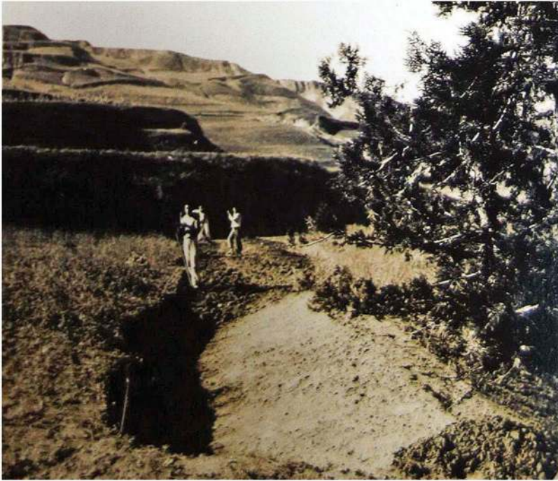
Figure 3. Digging broad-based ditches.