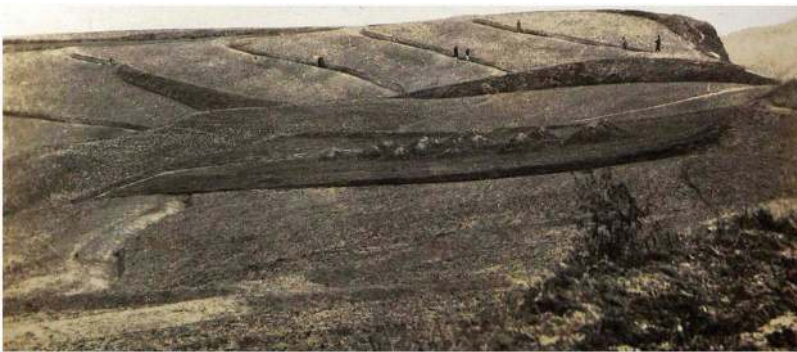
Figure 2. Terrace and Ditch construction at Liangjiaping.

The Experiment Area initiated its terrace and ditch demonstration projects in May 1943, when it built 386.4 zhang (about 1,288 meters) of terraces on the banks of