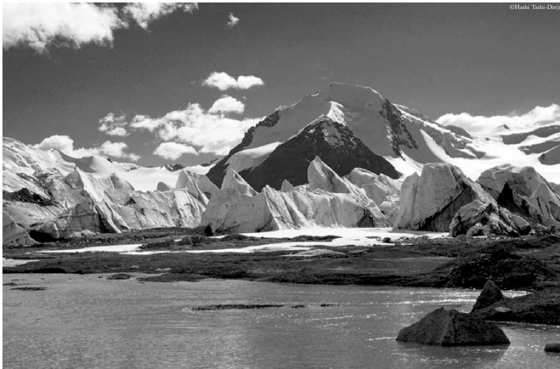
It looks refreshing now, but for how long?

they come in the form of intermittent heavy thunderstorms. When these downpours end, Suonan-Norbu says, the grass, which needs to be irrigated by slow steady rains, dries up and stops growing. “Now we have an uneven distribution of rainfall,” he observes. “The pattern doesn’t follow the rules as we knew it.”