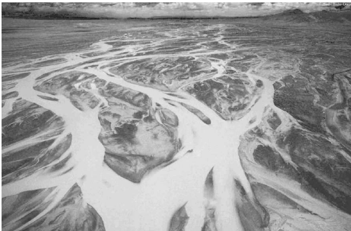
Bottoms up: The source of drinking water for two billion people.

year. The situation has become so severe that Peru, once 80 percent dependent on hydropower, has now had to build coal-fired plants to make up for the shortfall in its power output during the dry season, when its hydroelectric turbines run as low as 20 percent of capacity. Everywhere Thompson goes, he finds glaciers shrinking, retreating, and thinning at faster rates than he originally imagined.