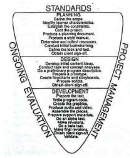
Figure 1. Allesi and Trollip Design and Development Model [24]

The research that will be carried out is a type of research on the development of video learning media based on TikTok content. This type of research uses the Research and Development (R&D) method. According to Mulyana [22], R&D research is a type of research whose goal is to create and develop new products using certain steps. development model Alessi and Trolip [23] provide a model for developing interactive multimedia materials that have three attributes that are always present and three phases, each consisting of various problems to be addressed and actions to be taken. The three attributes are standards, continuous evaluation, and project management. The three phases are planning, design, and development. This model is illustrated in the following Figure 1: