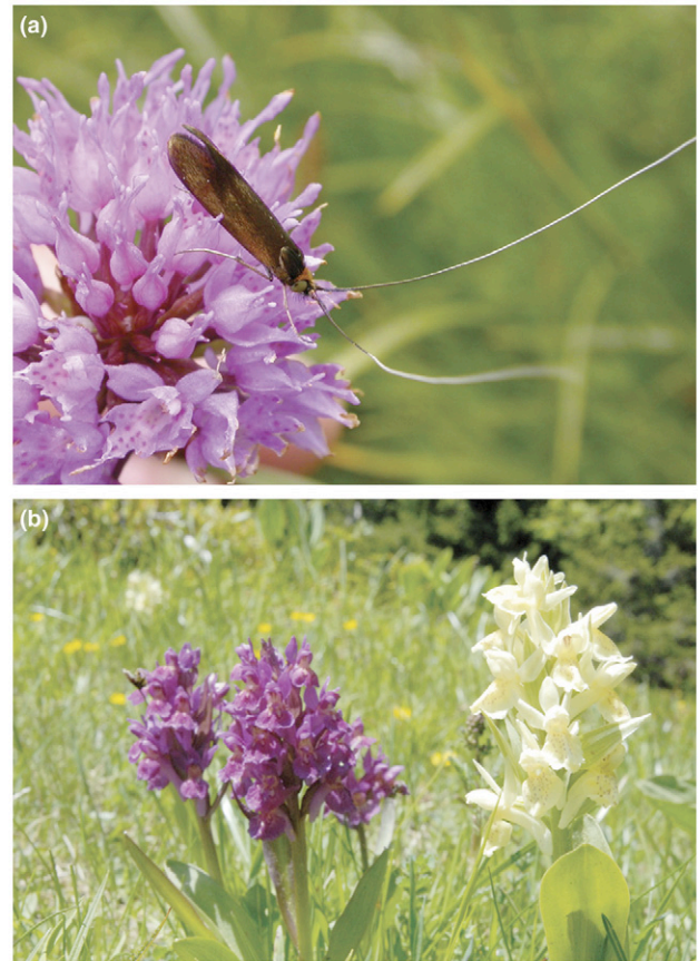
Figure 1. Should food-deceptive species flower earlier or later than rewarding species? The food-deceptive orchid Traunsteinera globosa (a) flowers relatively late in the season, with numerous co-flowering species, which appears to be beneficial to the reproductive success of the orchids. By contrast, the yellow and purple Dactylorhiza sambucina (b) flowers early in the spring, when co-flowering species are scarce, and is pollinated by newly emerged bumblebee queens. Early flowering might also be beneficial to the reproductive success of the orchid, because naïve pollinators did not yet learn to discriminate against deceptive plants.

Thus, we cannot yet identify a single, most beneficial strategy of co-flowering in space and time; more experiments are needed to clarify whether a strategy that anticipates flowering phenology of the rewarding species contributes to the maintenance of deceptive plants.