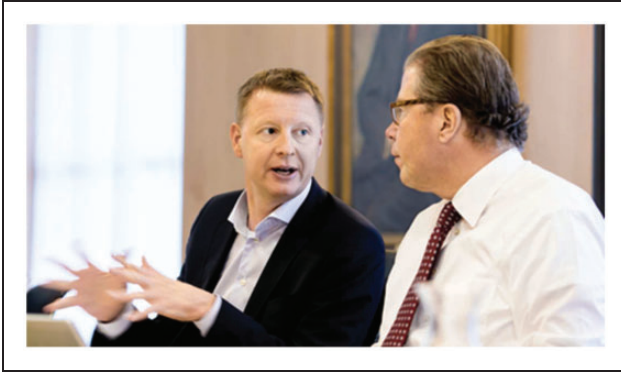
Picture 2. Hans Vestberg, CEO of Ericsson, vigorously talking to Leif Johansson, chairman of the board of Ericsson. A forward-looking and promising preamble above the picture says (in Swedish, excluded here): The connected society takes shape.