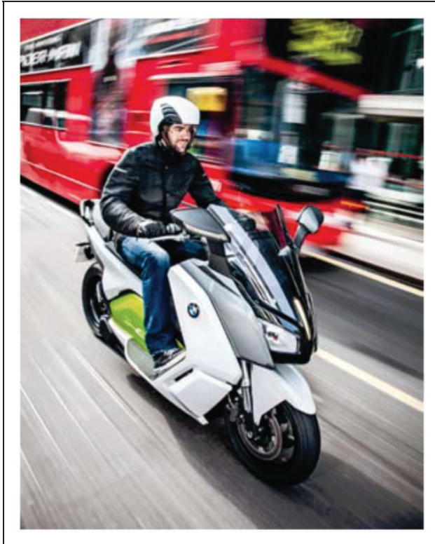
Picture 1. On sale from 2014—The new electric scooter from BMW.