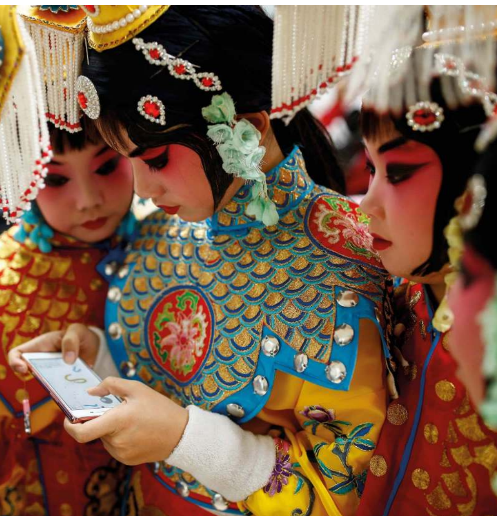
A participant in a traditional Chinese opera competition plays on her phone.

refined representations of actual use patterns. A session begins when the screen lights up and ends when it goes dark, and might last less than a second if it entails checking the time. Or it could start with a person responding to their friend's post on Facebook, and end an hour later when they click on a link to read an article about politics.