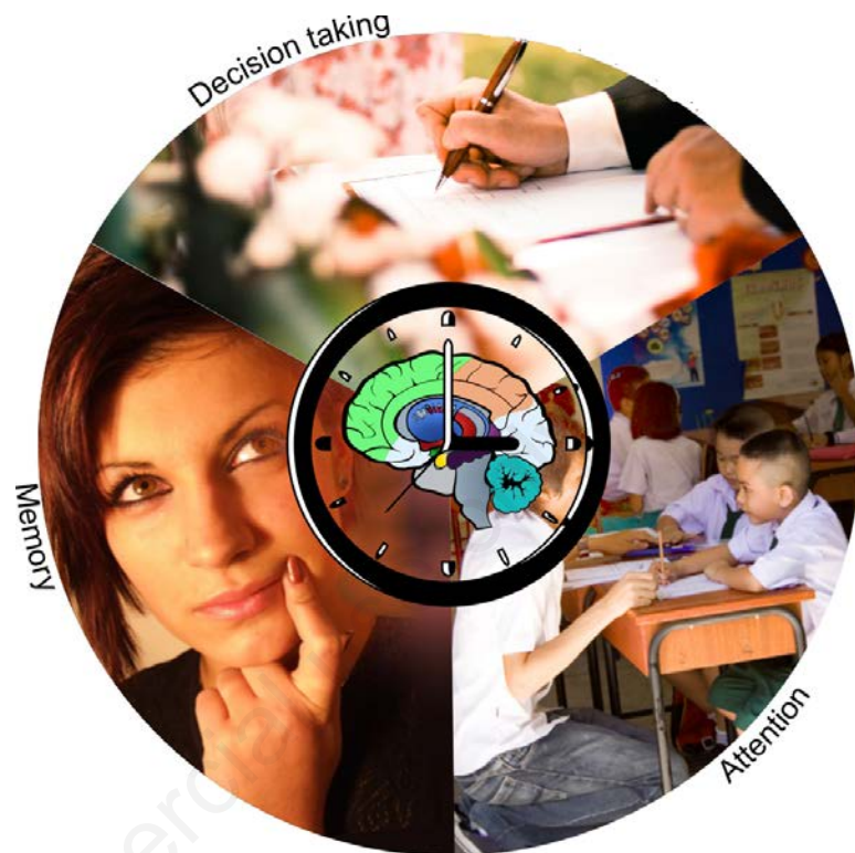
Figure 1. The central nervous system has a critical role in high hierarchy timing process and executive functions such as memory, decision-making and attention. 2

that are considered to represent specialized timing. 23 Independent of the models, human beings estimate and distort time. 24 Thereby, time notion is dependent on intrinsic (emotional state) and extrinsic context (sensitive