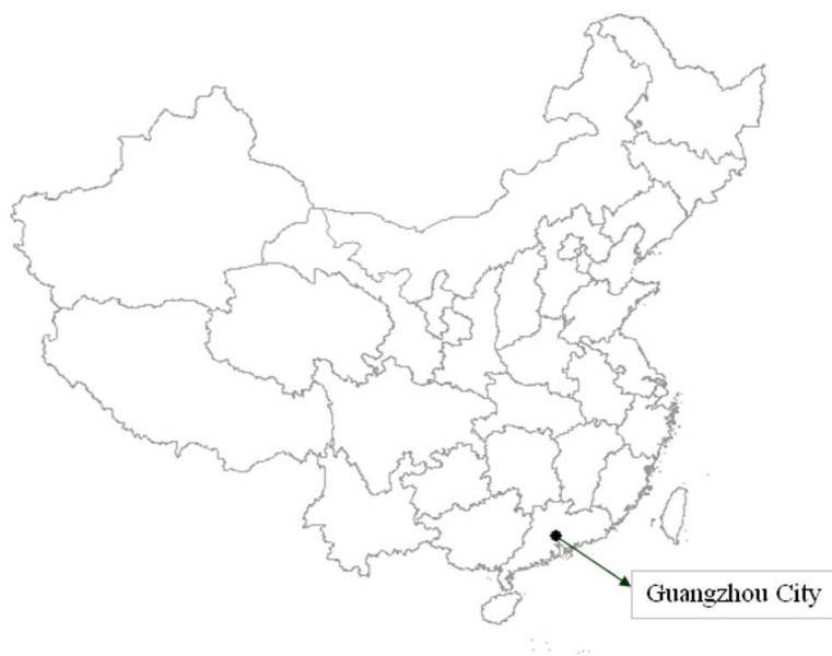
Figure 1 Location of Guangzhou in China.

Table 1 shows the Spearman correlation analysis for the relationship between dengue incidence (2001-2006) and weather variables with a lag of zero to three months. Monthly minimum and maximum temperatures, total rainfall and minimum relative humidity, at lags of zero to three months, were positively associated with the monthly dengue fever cases in Guangzhou over the study period. Monthly wind velocity was inversely correlated with dengue incidence at lags of zero and one, though no statistical significance was observed.