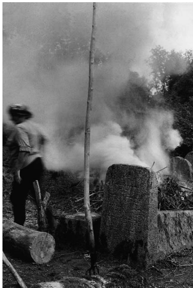
Figure 3. A Jewish cemetery, Berdichev (Ukraine).

caveat in mind, I am not proposing here that archaeology be turned into art, thus replicating the move of the archaeologists turned writers. As archaeologists, we have our own rhetoric, a Heideggerian way of manifesting Being, between the world and the earth. We work between revelation—how this truck exploded when driven over a landmine (González-Ruibal 2006, 186)—and concealment—why this house was abandoned (Buchli and Lucas 2001c). We are trained to read material traces and engage in meaningful and original ways with the qualities and textures of things; we know about material culture and history, and we have developed a methodology for documenting and interpreting the past. This methodology is so powerful that some artists are basing their work on it (most famously Mark Dion [see Renfrew 2003]), and writers such as Foucault and Freud constantly used archaeological tropes in their writings. Both artists and archaeologists are concerned with documentation, 1 but we archaeologists are specialists in it. Our mode of revealing truth includes a variety