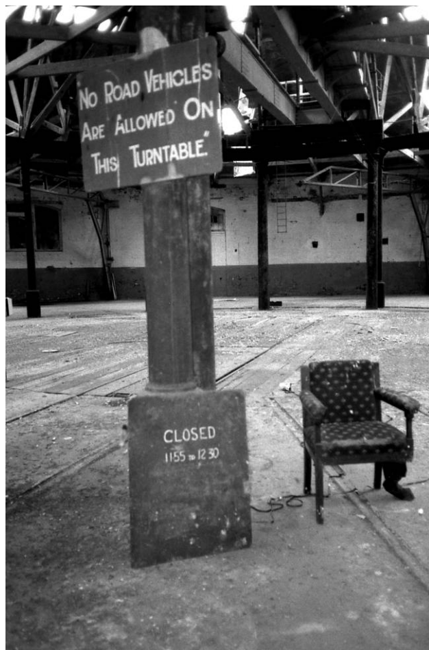
Figure 1. Industrial ruin.

Department of History and Center for Strategic Studies, State University of Campinas, C. Postal 6110, Campinas, SP, 13081-970, Brazil (ppfunari@uol.com.br). 22 IX 07