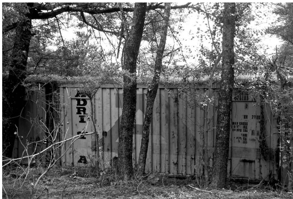
Figure 11. Containers from an abandoned development project in Benishangul-Gumuz (Ethiopia).

invisible bombers, and the missing bodies of political opponents. Archaeologists have to make things visible and public (Ludlow Collective 2001; Leone 2005; González-Ruibal 2007).