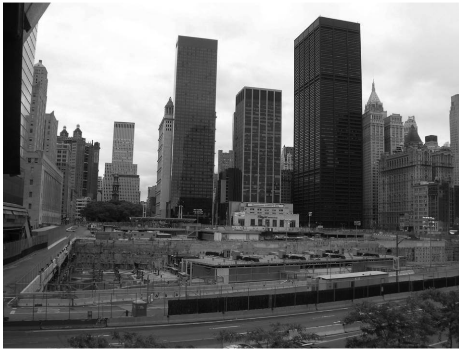
Figure 8. New York's Ground Zero.

cannot be controlled or subjected to a definitive interpretation, are more prone to sudden change (Domanska 2005, 405), but lieux de mémoire are also characterized by constant metamorphosis (Nora 1984, xxxv). As may be easily supposed, the role of archaeologists can be fundamental in changing the status of particular sites. The cold-war sites in the United Kingdom (Cocroft and Thomas 2003) are a good example of places of abjection that are being inventoried, classified, studied, and, therefore, ontologically transformed into mnemotopoi , soon to become lieux de mémoire . As Runia (2006a, 18) points out, the more a monument is interacted with, the more it loses its presence and becomes a platitude.