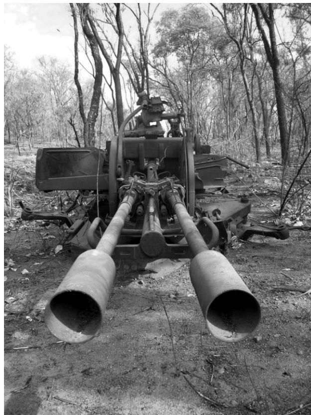
Figure 1. A Soviet anti-aircraft gun (ZSU-23) destroyed in an ambush during the Ethiopian civil war.

by the explosion, and the anti-aircraft gunner's seat, pierced by countless fragments. We have evidence that will not appear in the usual historical narrative but helps to create a strong sense of presence. At the same time, however, we can relate this micro-event to the global politics of the time, involving the cold war, development policies, nationalism, peasant societies, the history of ethnic and political conflict in the Horn of Africa, and modern technology. Suddenly, this is not just another tiny story but an event made globally significant. It all depends on how we tell it. Archaeology, then, can do more than produce alternative stories: it can also tell stories in an alternative way.