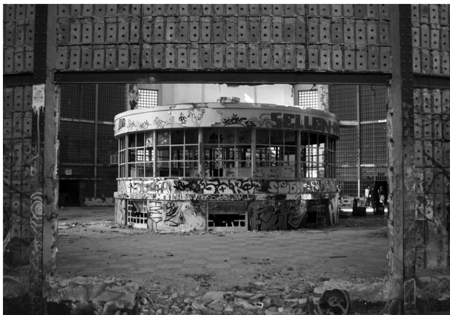
Figure 12. The panopticon of Carabanchel prison as seen from a gallery today.

is a place of abjection, but it is also a site of deep sociality—hardly a non-place.