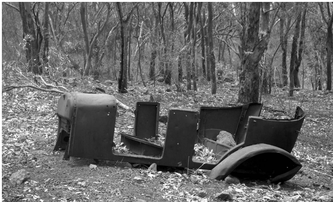
Figure 2. A Ford abandoned in the Italian military camp at Mankush (Ethiopia) by Mussolini's troops.