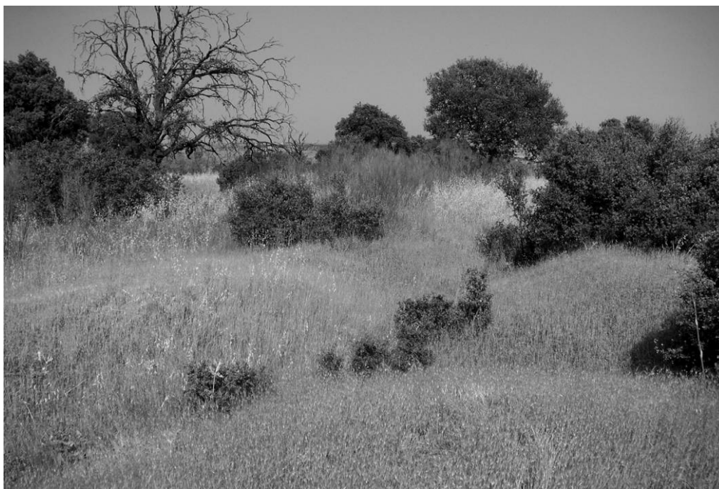
Figure 7. Overgrown trenches from the battle of Brunete (1937) near Madrid (Spain).

Most places are in constant ontological change. Their transformations depend on the materiality of the locale as much as on the social context, the historical circumstances, and the multifarious interests embedded in them. Places of abjection and mnemotopoi , as materializations of a nonabsent past that