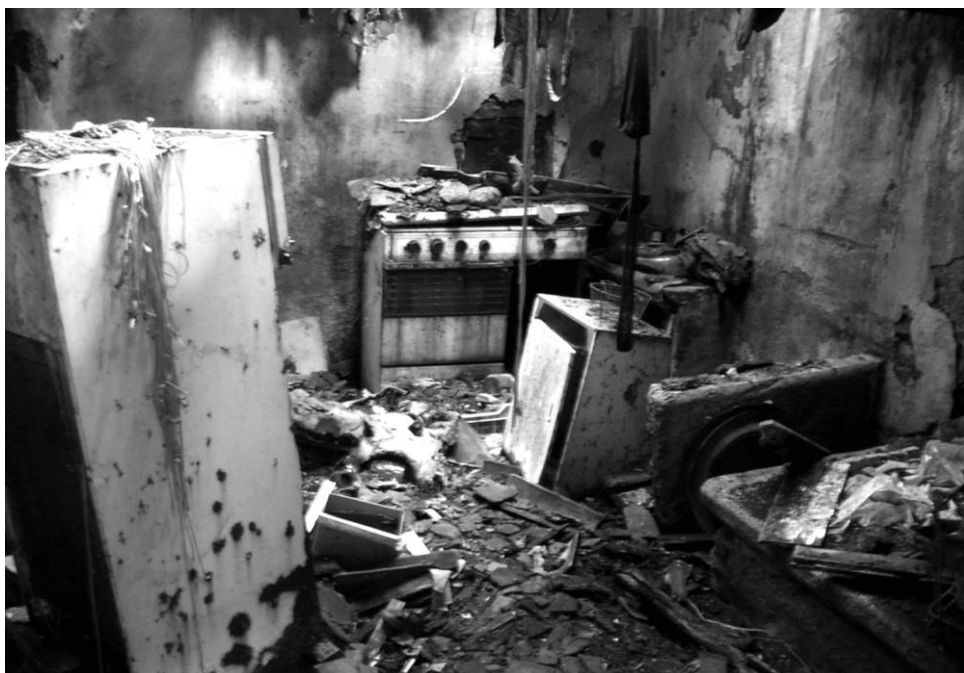
Figure 6. The interior of a house abandoned in Galicia (Spain) by emigrated peasants.