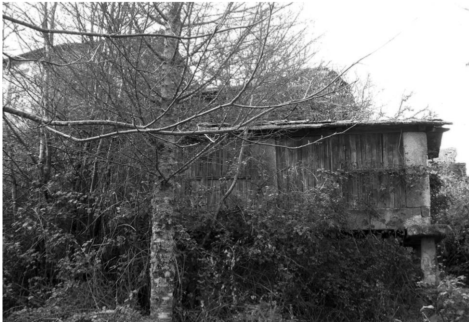
Figure 10. Ruined houses and granaries, concealed by overgrown vegetation, in Galicia (Spain).

trivial is even more threatening, but not many archaeologists seem to worry about this. It is not clear to me, for example, why we should document the over 500 remains of war planes from 1912 to 1945 that are known to exist in Britain (Holyoak 2002) or the 14,000 anti-invasion defenses in Britain from World War II (Schofield 2005, 57). Do we need 500 micro-histories about as many micro-events? What are the effects on collective memory of the preservation, restoration, and display of thousands of pillboxes? Although new ways of documentation and management are being developed (Schofield, Klausmeier, and Purbrick 2006) the risk of saturating and trivializing memory remains. Sites that are overdocumented and manicured lose their aura and their political potential. Against the deritualization of our world, which allows lieux de mémoire to deaden the past (Nora 1984, xxiv), archaeologists should return ritual to the landscape (e.g., Pearson and Shanks 2001, 142–46).