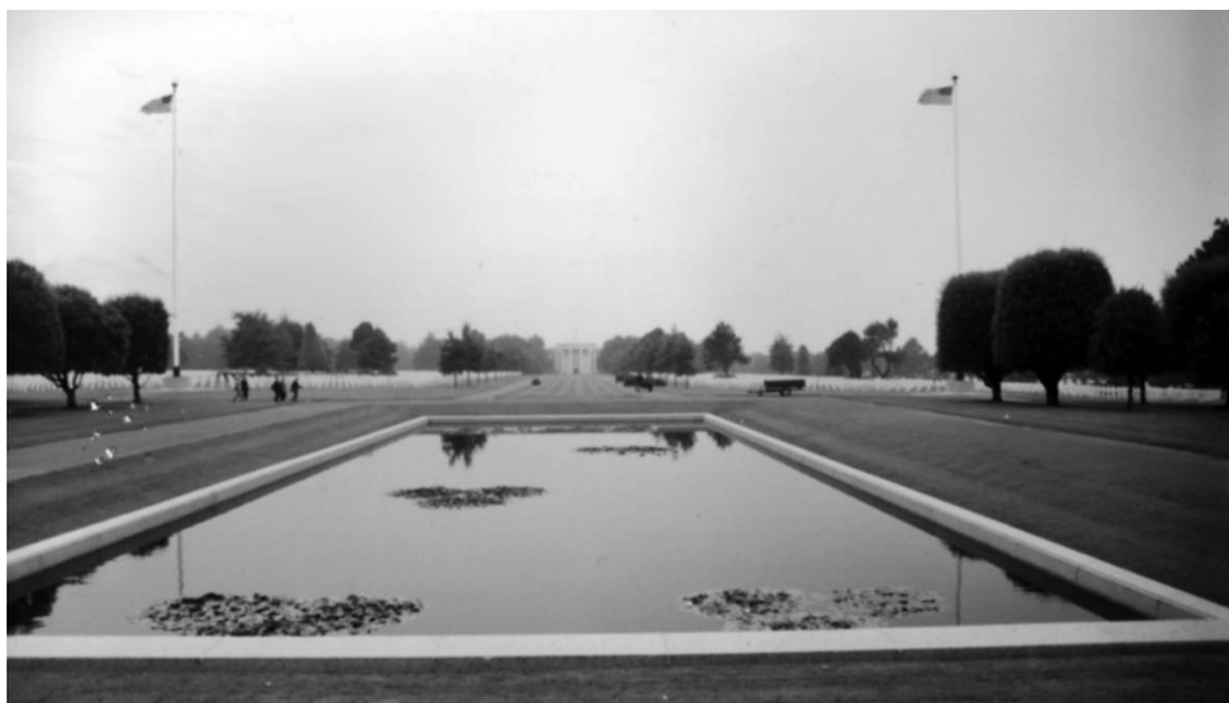
Figure 9. The American cemetery and memorial at Omaha Beach (Normandy).

but whether a locale should be remembered at all: consider the remnants of the Berlin Wall (Klausmeier and Schmidt 2004). Settlements with ruined vernacular architecture in Galicia are for many former peasants a dystopia about which they prefer not to talk. They are often isolated from new urban-style sprawls (fig. 10) and concealed behind façades of modernity—rows of modern brick-and-concrete houses along the roads (González-Ruibal 2005a). They convey a powerful message of poverty and underdevelopment for those who, until a few decades ago, depended on the plow for their survival. Nonetheless, they are also lieux de mémoire for many educated urban Galicians: the sturdy vernacular house is a symbol of national identity as much as the anthem and the flag ( lieux de mémoire in Nora's sense), and it has been constructed as an everlasting ethnographic element, a metaphor for "Galicianness," by local anthropologists (González-Ruibal 2005b, 140–42). These conflicting views on the archaeology of the recent past produce heterogeneous built environments, environments as heterogeneous as the narratives about that same past: thus, there are villages with some houses refurbished in pseudo-vintage style by urbanites and others, in ruins, whose former inhabitants have decided to build modern residences elsewhere. Dystopia and Utopia may coalesce in the same spot.