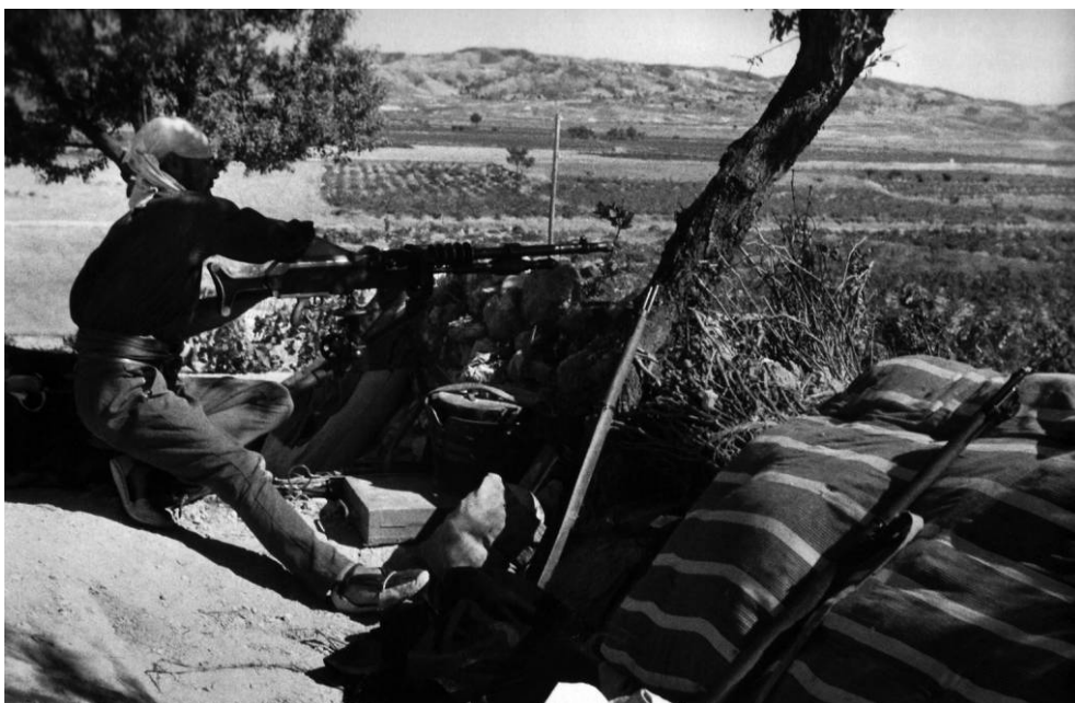
Figure 5. A Spanish peasant, in traditional attire, using a machine-gun in 1936.