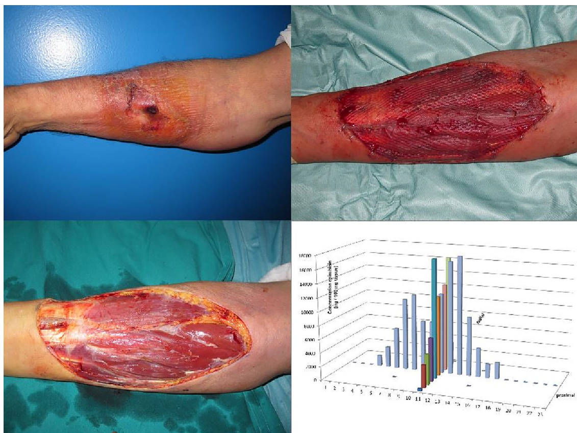
Fig. 1 Doxorubicin tissue distribution after extensive extravasation (subject 6). A 65-year-old male lymphoma patient suffered a doxorubicin extravasation on the right forearm (upper left picture). Surgery was performed 26 days after the incident (lower left picture). The

defect was covered with a split-thickness skin graft (upper right picture). HPLC analysis showed a pyramid-shaped distribution pattern with the highest concentrations in the central area, where the extravasation originally happened (lower right picture)