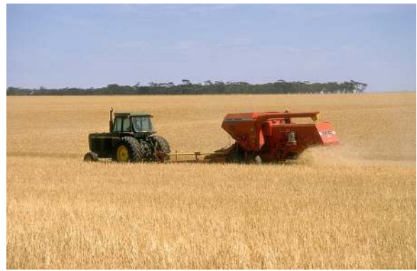
Fig. 3. Temperate eucalypt woodland replaced by grain cropping in Australia.