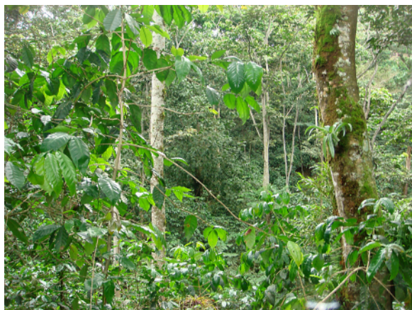
Fig. 4. A structurally complex coffee agroforestry farm in Chiapas, Mexico.

Although many agroforestry commodities like coffee and chocolate are not essential food staples, like basic grains or vegetables, they nevertheless represent an important part of the economies of many poor countries, supporting millions of people throughout the tropics. From an ecological perspective, coffee and cacao are special in that both occur as understory plants and grow well under shade trees, creating an “agroforest” that structurally resembles the forests they replaced (Fig. 4: Fig. 1 quadrants A and C). Coffee and cacao agroecosystems are becoming emblems of managed ecosystems that can be planned to contribute to sustainable agriculture in a variety of contexts. First, as a repository for biodiversity, they sometimes house levels of biodiversity that rival nearby native systems (Perfecto et al., 1996). Second, shaded coffee and cacao systems can contribute a high quality matrix element in landscapes where biodiversity is maintained through dispersal dynamics that promote the persistence in remnant patches (Perfecto and Vandermeer, 2008). Third, because the physical structure of agroforests mimics that of native forests, they are thought to provide a buffer to some of the negative impacts expected under global climate change (Vandermeer et al., 2010). Fourth, the biodiversity harboured within these agroecosystems and the adjacent native habitats contribute to ecosystem services such as pollination and pest control (Vandermeer et al., 2010).