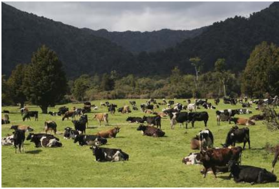
Fig. 2. Intensive dairy farming in New Zealand.