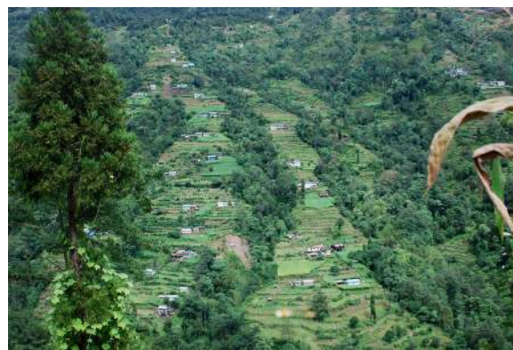
Fig. 5. Small scale farming in the Eastern Himalayas.

The striking differences between the systems (i.e. cereals in a cleared woodland and coffee in an agroforest), illustrate the point that options for better biodiversity outcomes in agriculture depend on the inherent contrast between the productive land-use options and the pre-agricultural ecosystem (Fig. 1). In regions where trees have made way for annual cropping systems the contrast is so great that there will be few options for significant biodiversity outcomes in the agricultural matrix, because the endemic forest or woodland-dependent biodiversity is not supported by the agricultural habitat. It becomes especially important in these circumstances to ensure that interpatch dispersal can occur, to sustain the remnant populations (Perfecto et al., 2009). In contrast, where complex agroforests replace native forest, it is more likely that agriculture can approximate structurally and spatially complex environments that are productive and support biodiversity (Clough et al., 2011; Perfecto and Vandermeer, 2008). Explicit recognition of the diversity of relationships between production and biodiversity is the first step in balancing trade-offs in different agro-ecological systems. Clearly, not all land-use options or technologies are equivalent in their impact (on production or biodiversity) under different social, economic, biogeographic and ecological contexts (Tscharrntke et al., 2011).