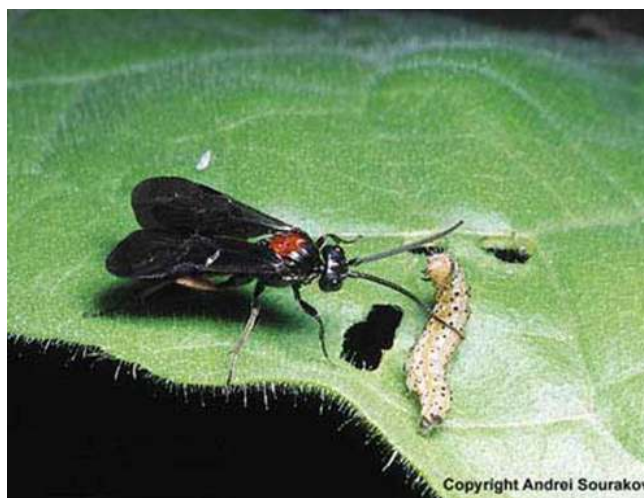
Figure 6. The wasp parasitoid Cardiochiles nigriceps Viereck, approaches a potential host, an adult tobacco budworm, Heliothis virescens (Fabricius).

Pathogens are also known to inflict mortality. Among the known pathogens are microsporidia, Nosema spp., fungi such as Spicaria rileyi , and nuclear polyhedrosis viruses. In a study conducted in