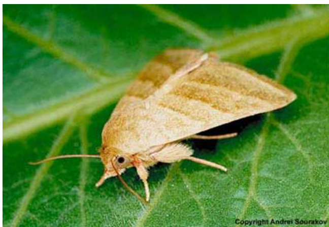
Figure 4. An adult tobacco budworm, Heliothis virescens (Fabricius).

The moths are brownish in color, and lightly tinged with green. The front wings are crossed transversely by three dark bands, each of which is often accompanied by a whitish or cream-colored border. Females tend to be darker in color. The hind wings are whitish, with the distal margin bearing a dark band. The moths measure 28 to 35 mm in wing span. The pre-oviposition period of females is about two days in length. Longevity of moths is reported to range from 25 days when held at 20°C, to 15 days at 30°C. A sex pheromone has been identified (Tumlinson et al. 1975).