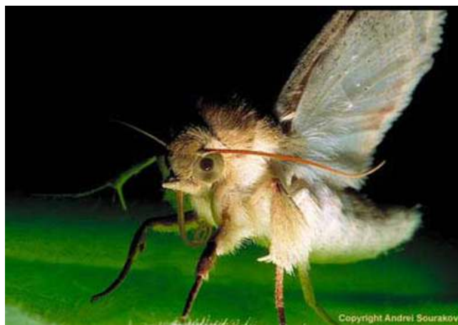
Figure 1. A closeup of an adult tobacco budworm, Heliothis virescens (Fabricius).