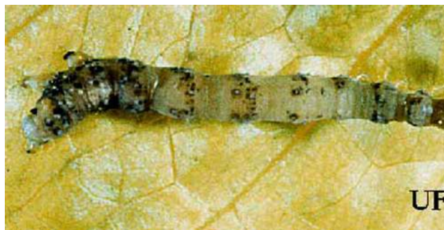
Figure 8. Looper infected with a nuclear polyhedrosis virus.

Although there is little evidence for natural resistance to tobacco budworm among many crops, cotton is being genetically engineered to express resistance (Benedict et al. 1996). Enhanced resistance to larval survival by cotton should result in lower insect pressure on nearby vegetable crops.