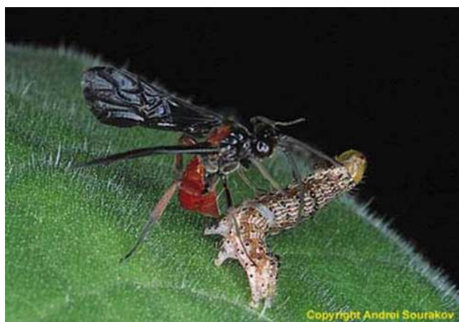
Figure 7. The wasp parasitoid Cardiochiles nigriceps Viereck, stinging an adult tobacco budworm, Heliothis virescens (Fabricius).

South Carolina, Spicaria was a more important mortality agent than natural incidence of virus, and was considered to be one of the most important natural mortality agents (Roach 1975).