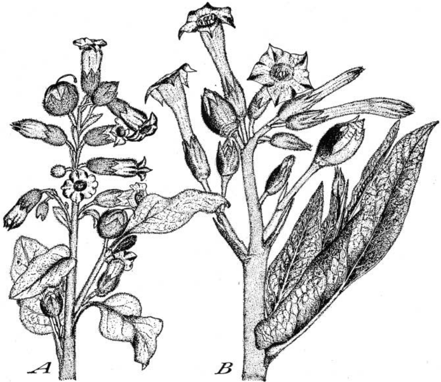
Figure 1 Tobacco in North America. The original figure legend that accompanied this drawing by H.A. Allard reads: “Two species of tobacco cultivated extensively by the aborigines when the first colonists came to North America: Nicotiana rustica (A) and N. tabacum (B), showing buds, flowers, and green seed pods” (33).

was $16 billion; of this, tobacco was valued at $542.5 million, from an estimated production of ~1.4 billion pounds on 1.9 million acres of land (83). Tobacco was also an important source of revenue for the U.S. government. With ~8 pounds of tobacco consumed per capita in the United States in 1919 and 23 billion cigarettes available for domestic consumption (42), tobacco had become an entrenched part of American culture (Figure 2). Consumption of tobacco products per capita, aged 15 and over, in 1962 was almost 11 pounds (84). Today, per capita consumption is ~4 pounds, for those aged 18 and over (10).