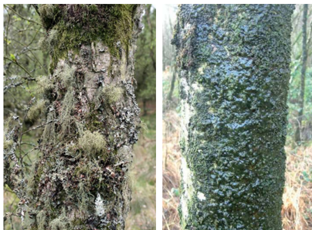
Ammonia can kill tree-living plants (left), replacing them with algal slime.