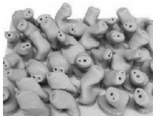
Figure 5. Individually customized hearing aid shells mass-produced by an EOS laser sintering system. Special CAD software has been developed by Materialize to make the process of converting the customers' ear canal laser scan data into the product easy and seamless.