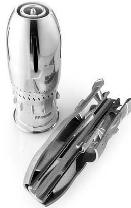
Figure 3. Fuel Injection Swirler (made out of Cobalt Chrome MP1) from Morris Technologies. This part would be impossible to cast but can be easily made through additive manufacturing.