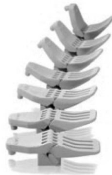
Figure 4. Tie-down clamp made as a single integrated moving component on EOS SLS system.