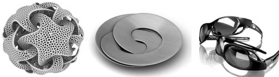
Figure 6. Quintrino lampshade by Bathsheba Grossman (Grossman, 2010), Reproduced with permission, Bathsheba Grossman, Bathsheba Sculpture LLC. Rollercoaster plate by Freedom of Creation (FOC, 2010), Reproduced with permission, Freedom of Creation, Holland, and Treviso Technologia designer sunglasses made for Crabbi Sun Living in production runs of 500 pairs (EOS, 2010d). Reproduced with permission, EOS, Germany. These products were manufactured using selective laser sintering and could not have been cost-effectively made using traditional manufacturing methods.