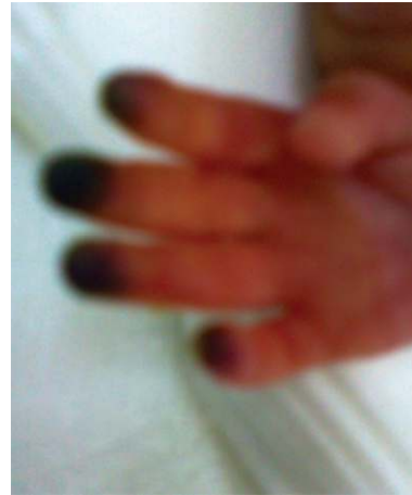
FIGURE 1: Digital involvement of the right hand 8 hours after brachial artery cannulation.