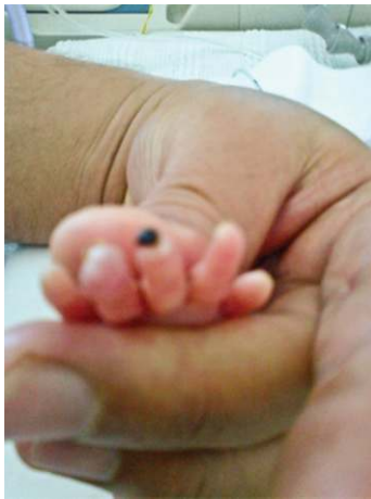
FIGURE 4: Residual ischemia at the tip of the middle finger after 10 days.