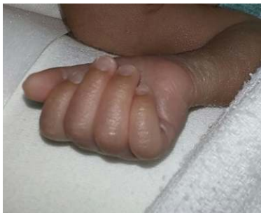
FIGURE 5: Complete resolution 7 weeks after the incident.

concentrations of the vitamin-K dependent factors, contact factors, and direct inhibitors of thrombin being approximately 50% of adult values at birth [13–15], whereas \alpha 2-macroglobulin, factors V, VIII, and XIII, and von Willebrand factor are increased in the first few weeks of life [16, 17]. Healthy preterms gradually attain adult coagulant protein levels by 6 months of age, but in the interim any illness may disrupt hemostasis leading to a fall in \alpha 2-macroglobulin, with subsequent thrombosis and ischemia [18]. Moreover, the placement of catheters may cause additive vascular endothelial damage which incites a rapid inflammatory cascade that enhances platelet adhesion and aggregation through the release of adenosine diphosphate and thromboxane, resulting in localized stasis, reduction in blood flow, and thrombosis [19]. The affected area is soon compromised with absent pulses and becomes pale, cool, and markedly discolored [20].