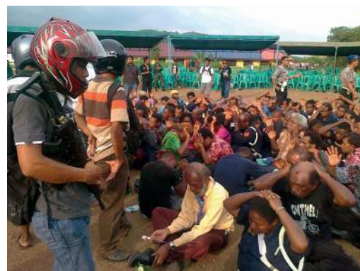
Figure 4: Indonesian security forces dismiss the Third Papuan Congress, 2011

This pattern of violence and torture as normality has persisted until this decade. The image in Figure 4 shows the Indonesian state and security authorities forcefully dismissing a major gathering of Papuans during the “Third Papuan Congress of 2011”. This public event brought together some two thousand Papuans on the soccer field of the Catholic School of Theology “Fajar Timur” in Abepura (PGGP and Elsham Papua 2011). This was a prominent event organized by the Papuan leadership, and it was broadly covered by local and national media (PGGP and Elsham Papua 2011). 25 The main agenda of the Congress was the election of a new Papuan nationalist leader, which was thwarted by the raids of the joint police and military forces who completely brought the process to a halt.