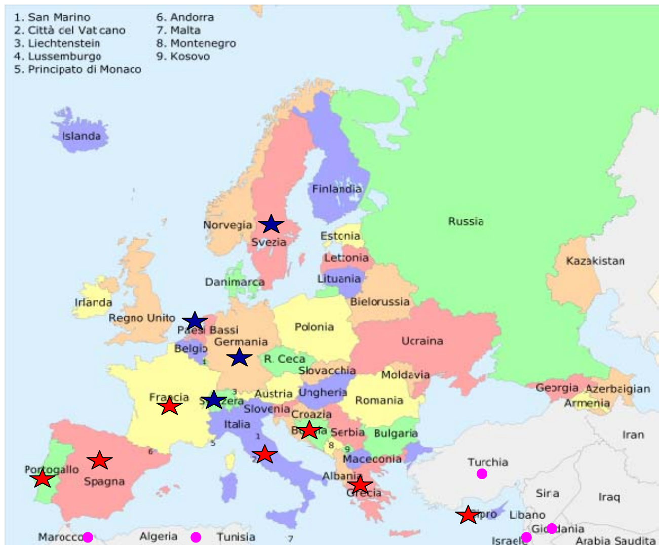
Fig. (3). Circulation of Toscana virus in Europe and in other countries. ★: native cases of TOSV infection; ★: imported cases of TOSV infection; • TOSV seropositivity in the population.