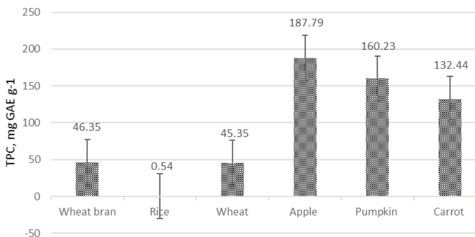
Figure 2. TPC in raw material for crispbreads.

Some studies indicate that levels of phenolic acids, especially ferulic acid and diferulate esters of some whole grain products, including wheat products increase after thermal treatment.