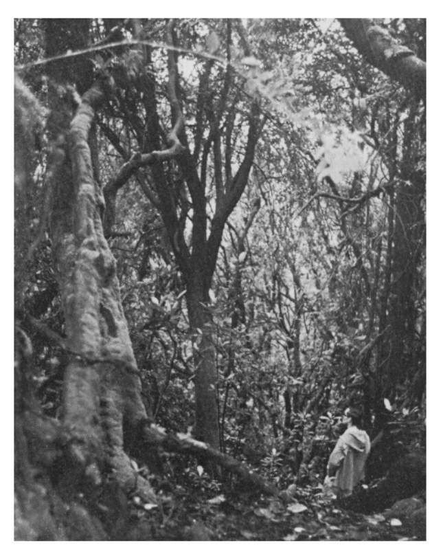
FIG. 2. Cloud-forest in Volcan Poas National Park close to San José, Costa Rica. The cloud-forest is a very fragile ecosystem, and visits by the ever-increasing number of tourists (close to 100,000 in 1974) are being restricted by carefully managed and supervised schemes along trails.

(a) As a general guideline the tourist industry should support conservation organizations financially as an investment to further its own interests, though sometimes it may be necessary to attach conditions to such financial aid. It is quite clear that financial contributions will be particularly productive if