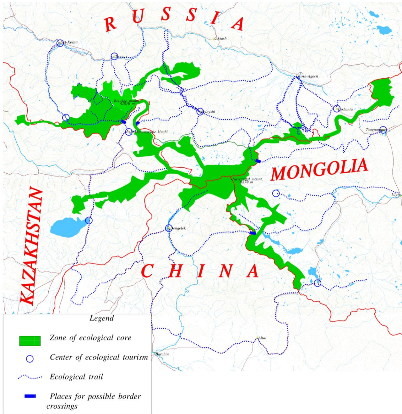
Fig. 4. Promising ecotourism frame of the cross-border Altai