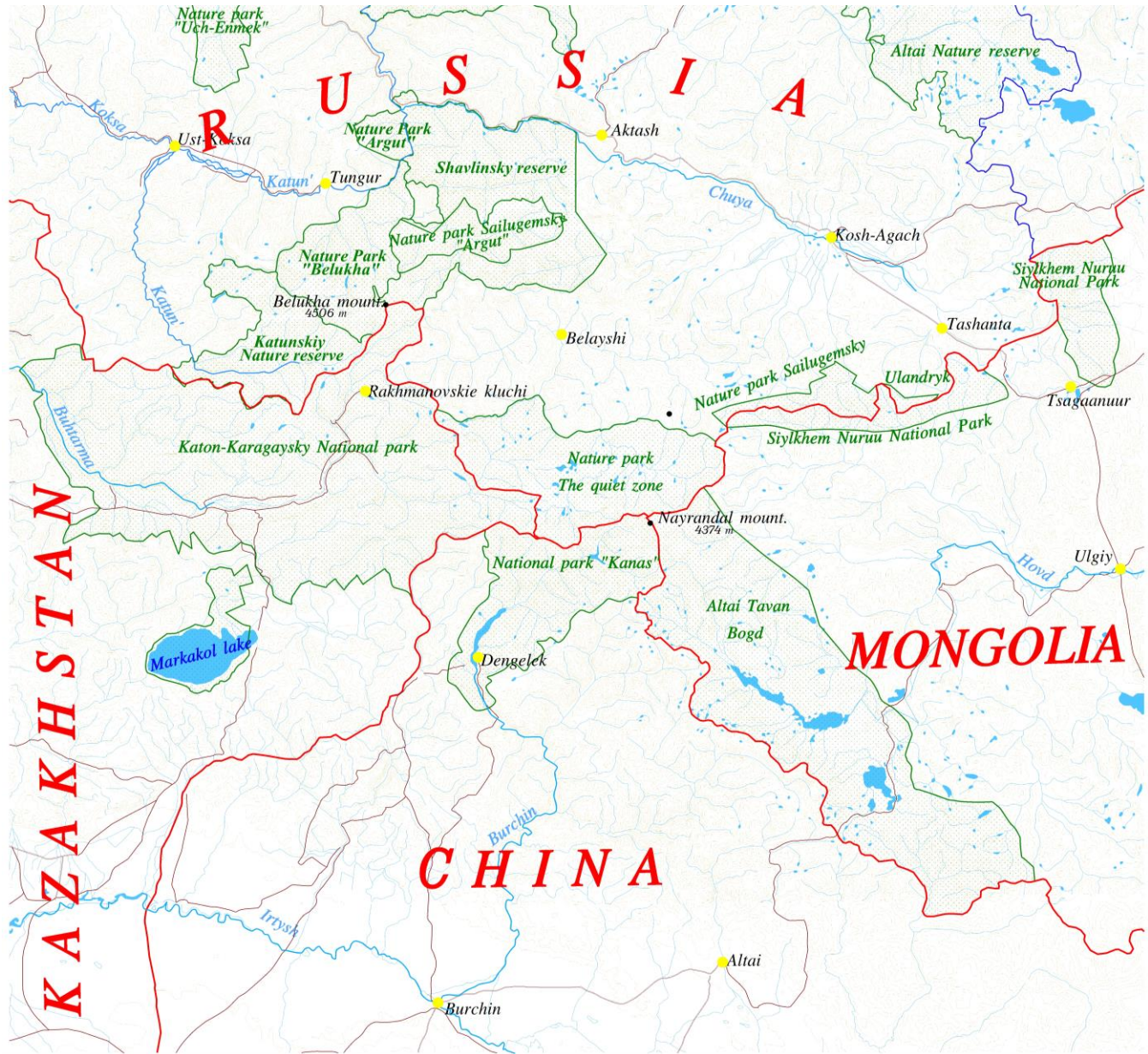
Fig. 1. Protected areas of the cross-border Altai region