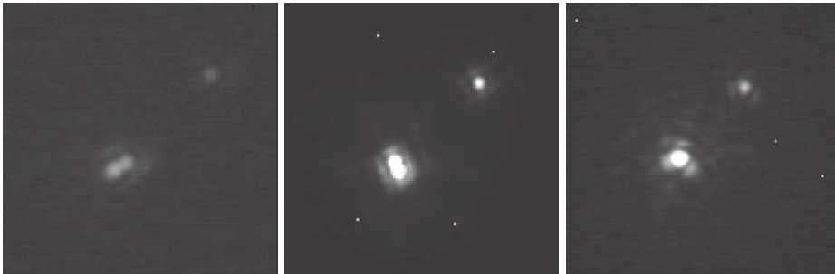
Figure 1. (top) Epoch 05 May 2012 VLBI image of the binary HII 2147 system. Both components are clearly detected. The projected separation between the binary components is 50 mas or roughly 6 AU. (bottom) Three epochs of Keck II /NIRC2-NGSAO imaging of HII 3197. The system is resolved into a triple and significant orbital motion of the close pair is seen from 2006 (left) to 2011 (middle) and 2012 (right). North is up and East is left in each image. The separation between the close pair and the tertiary is \approx 0.6'' .