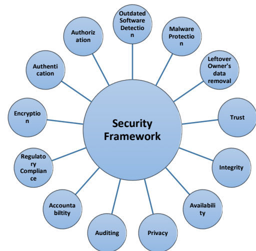
Figure 3. Security requirements agreed by security experts

All the experts agreed that the security framework designed to secure the VM image in cloud computing is comprehensive, with none of them adding more security requirements. Regarding overlaps between the security requirements and other approaches to securing the VM image, the majority of the experts did not identify overlaps between the provided security requirements. However, Expert G suggested that auditing could be substituted for accountability. Moreover, Expert D suggested that accountability is part of regulatory compliance, and so accountability can be removed.