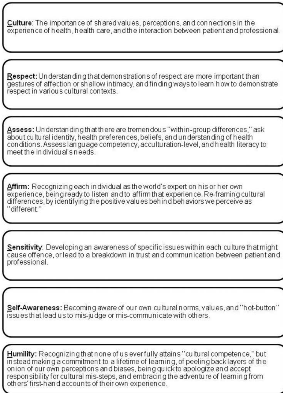
Figure 1. Primary components of the CRASH Course in Cultural Competency Skills. This figure describes each of the primary components of the CRASH Course.