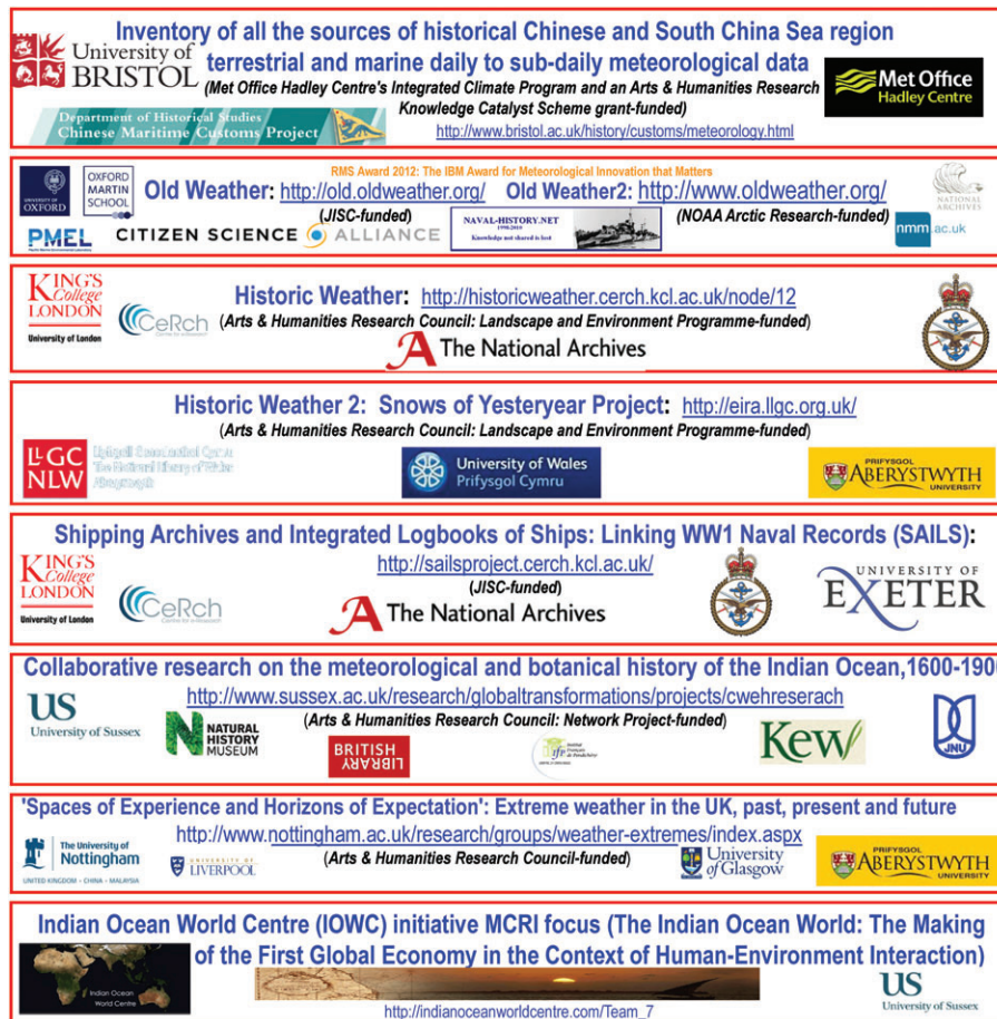
FIGURE 2 | ACRE collaborations with Citizen Science, Social Sciences, Humanities, and Arts projects.

is the 3-year AHRC-funded research project, supported under the AHRC's Care for the future: thinking forward through the past theme and led by the University of Nottingham, with colleagues at Aberystwyth, Glasgow and Liverpool Universities and in partnership with ACRE (Figure 2), The Royal Geographical Society (with the Institute of British Geographers) and Historic England. This team is recovering and integrating historical documentary evidence of past extreme weather events in a series of case studies across the UK—in Southwest, Central and Eastern England, central and coastal Wales and Northwest Scotland. The research, which draws on a wide variety of materials from farmers' diaries and estate correspondence through to school records and qualitative and instrumental weather diaries, is providing the evidence needed to construct a comprehensive history of extreme weather events and their societal implications across the UK over recent centuries ( http://www.nottingham.ac.uk/research/groups/weather-extremes/index.aspx ).