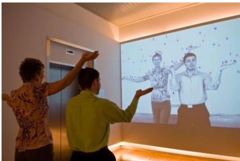
Figure 3. Text Rain , by Camille Utterback and Romy Achituv (1999).

“Insofar as the installation does not aim at the reading of the text, it acts rather as digital art than as literature. Therefore my suggestion of differentiation is not so much based on proportionality but on the role played by the text as a whole.” (Simanowski, 2007: 53). If the text is considered in the creation as a linguistic phenomenon to interpret, one can speak of digital literature. If the text becomes a visual object of interaction (as in the installation Text Rain ), it is more digital art. The tension on the semiotic