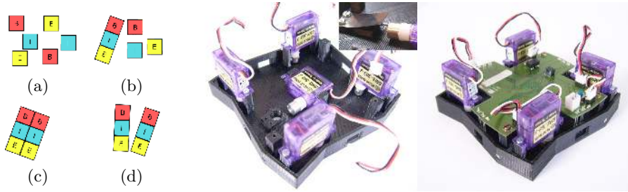
Fig. 1. Left: (a–d): illustration of the growth and replication process. Center/right: generic hardware prototype capable of simulating all aspects of the e -, i -, and b -modules. Center: squared base with four connection sides. The inset shows a hatch in the bottom plate, which controls the mobility of the module, which floats on an air table. Right: fully assembled prototype (battery removed).

growth phase, it deactivates its two lateral connection sides. As a consequence, the modules form polymers (i.e., linear chains) of arbitrary length. Once a b -module connects to either end of such a polymer, a signal propagates to the other end, and thereby a membrane is established (see Fig. 1b). The membrane prevents further extensions on either side of the polymer during its lifetime. The self-assembly process thus results in linear organisms that are composed of \geq 1 e -modules, \geq 0 i -modules, and 1 b -module.