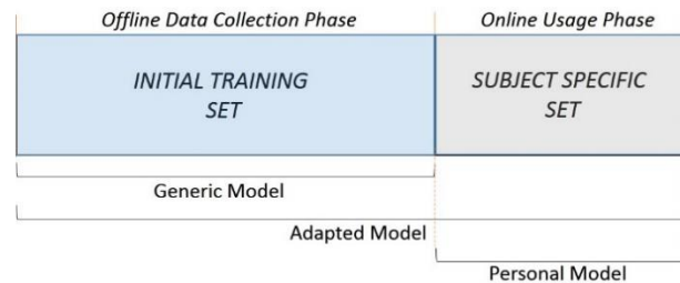
Figure 2. Training sets used for different models: (1) Generic, (2) Adapted, and (3) Personal.

In this paper, we investigated the improvement that could be achieved by personalized models: Since self-labels are not available for the current dataset, we considered the ground truth labels as self-labels. We applied personalization through including person-specific data during the training phase, for both of the uni-modal classifiers. We experimented with two different approaches on how to include the person-specific data: (1) ‘Adapted’, and (2) ‘Personal’. In ‘Adapted’, we augmented the initial training set of the ‘Generic’ model, collected from a different set of students, with the acquired and labeled instances of the test subject. In ‘Personal’, person-specific training sets are generated by using only the personal data. The aim of the ‘Adapted’ model is to merge the capabilities of the ‘Generic’ detector (which is trained on a large database) with the characteristics residing in the person-specific data. However, if the personal data is sufficient for training, the ‘Personal’ model would be better to represent person-specific behaviors. In Figure 2, the training sets used in different models are visualized. In Section 4.3, the preliminary experiments to show the need for personalized models are summarized.